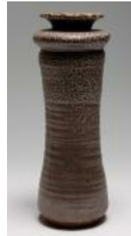
Untitled (Brown Vessel) (2023.19.2)