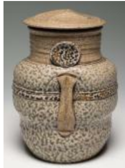
Untitled (Salt Glazed Lidded Jar) (2023.19.1)