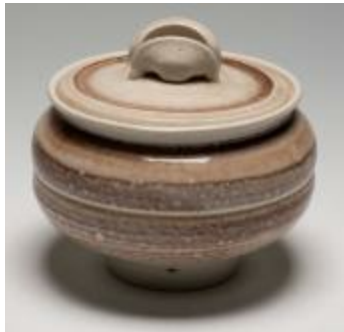
Lidded Bowl (2023.19.4)