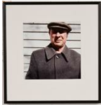
Harry Callahan, Providence, RI (1998.5.13)