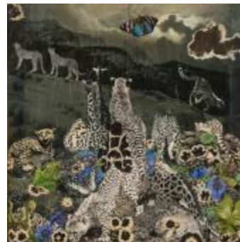
Tropism #5 (2017.7.1)