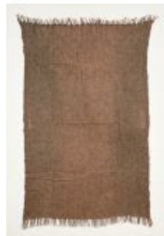
Mohair Throw (2013.2.13)