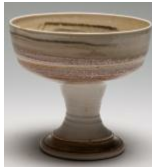
Untitled (Bowl with Stem) (2023.19.6)