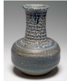
Untitled (Blue Vase with Extended Neck) (2023.19.3)