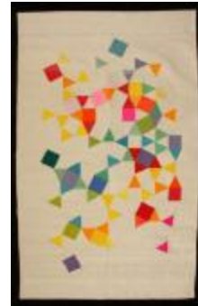
Untitled from the Geodesic series (2008.8.1)