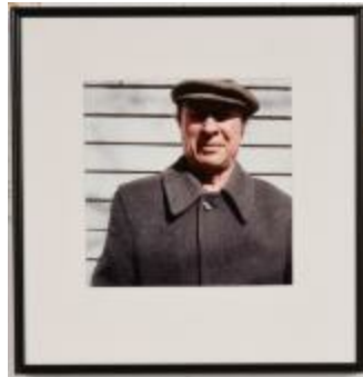
Harry Callahan, Providence, RI (1998.5.13)