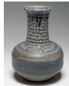
Untitled (Blue Vase with Extended Neck) (2023.19.3)