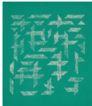
Double Impression III (2013.6.1)