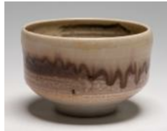
Untitled (Bowl) (2023.19.5)