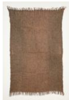
Mohair Throw (2013.2.13)