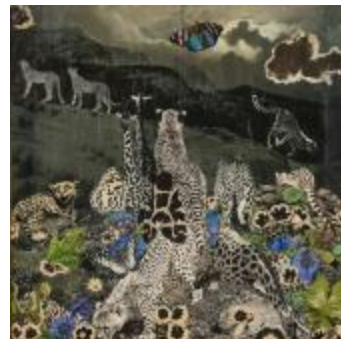
Tropism #5 (2017.7.1)