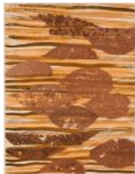
Leaf Study (1997.6.3)