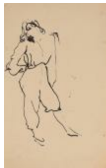
Untitled (Female Figure) (2013.17.4)