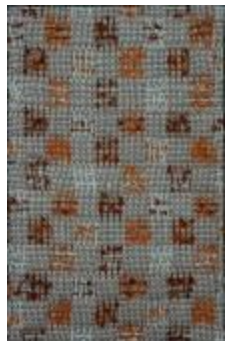
8 Harness Group Weaving Sample (1997.6.2)