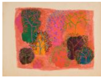
Untitled (Abstract) (2013.17.16)