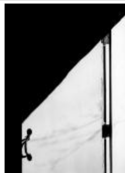
Quiet House Door (2018.8.1)