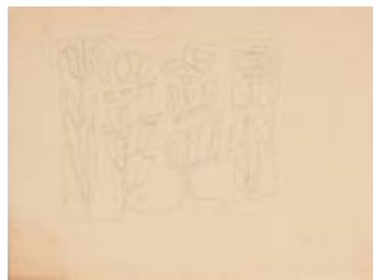
Untitled (Floral Design) (2013.17.13)