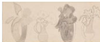
Untitled (Vase with Flowers) (2013.17.1)