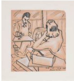
Kenneth Noland Drawing a Model at the Rue d'Assas Atelier of Instructor Ossip Zadkine (1996.9.2)