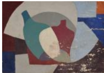
Untitled (Abstract Still Life) (2004.1.1)