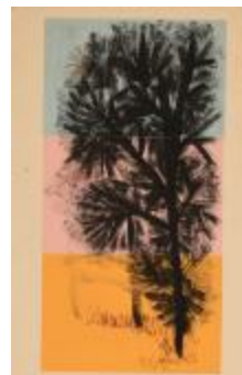
Untitled (Abstract) (2013.17.6)