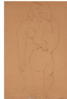
Two Women (2004.6.1)