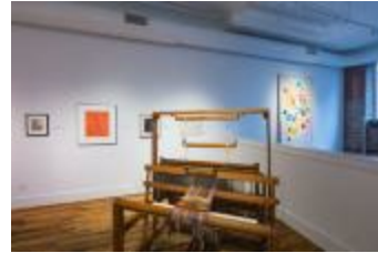
Shuttle-Craft Practical Loom from the Black Mountain College Weaving Workshop (2000.5.1)