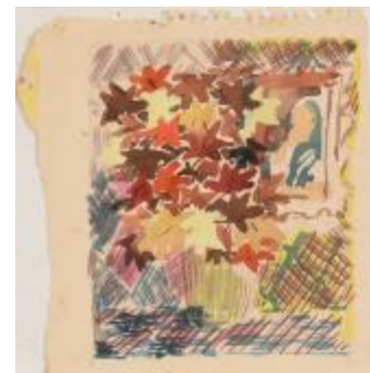
Untitled (Flowers in Pot) (2013.17.2)