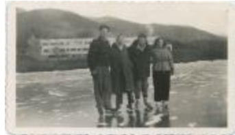
Ice Skating on Lake Eden (2000.3.1)