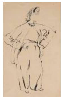
Untitled (Female Figure) (2013.17.9)