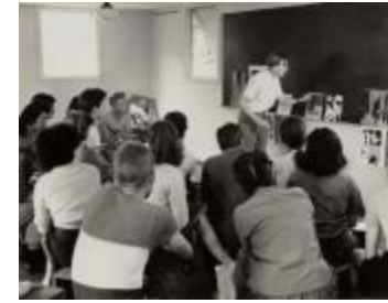
Josef Albers' Color Class (1998.2.4)