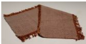
Upholstery Fabric (2021.55.1)