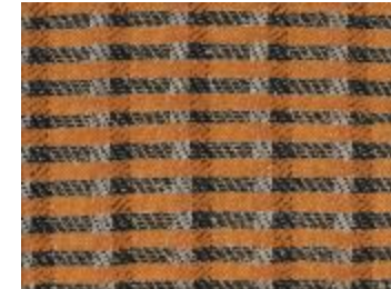
8 Harness Group Weaving Sample (1997.6.1)