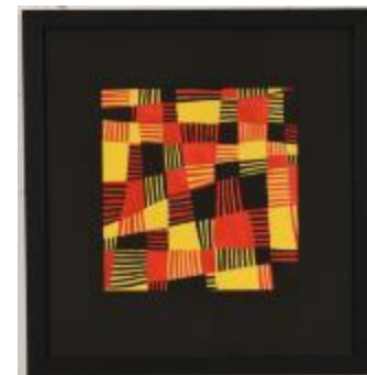
Color Study (1997.6.5)