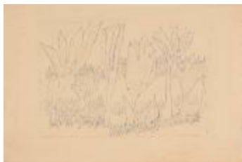
Untitled (Flowers/Abstract) (2013.17.3)