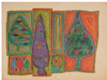
Untitled (Design) (2013.17.12)