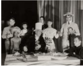
The Ruse of Medusa Production (1998.2.5)