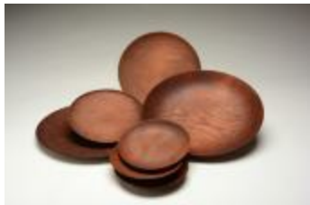
Wooden Plates Made at Black Mountain College (2007.2.2-8)