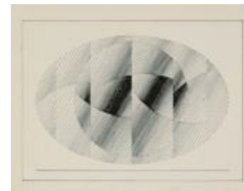
Early Elipse Drawing from Portfolio with Templates (2019.1.8)