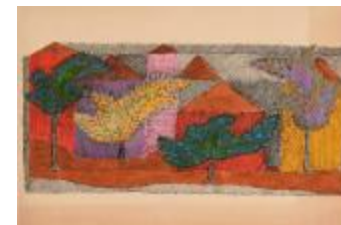
Untitled (Hillside Landscape) (2013.17.11)