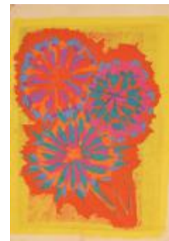
Untitled (Floral Abstract) (2013.17.7)