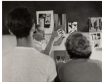
Josef Albers' Color Class (1998.2.2)