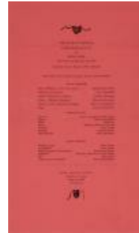
Program for The Ruse of the Medusa (1997.1.1)