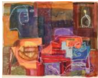
Still Life With Head (1995.3.4)