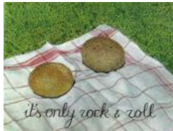
It's Only Rock & Roll (In Memoriam: Elvis Magritte) (2012.4.11)