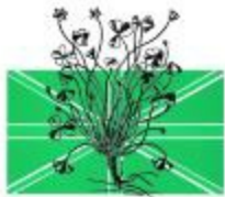
Wild Irish Oath, to Be Uttered When It Is Discovered that the Protestants & Roman Catholics Were Ready to Forget All and Turn