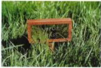
Et in Arcadia Ego: Homage to Garth MacVader and Any and All Down the Primrose Paths of Righteousness (Pompous Grass) (2012.4.10)