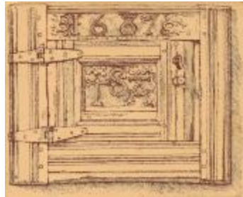
The Spice Cupboard (1687) In The Parlour At Corn Close Recalls The Most Diabolical Remark It's Heard During The First 300 Years (2012.4.18)