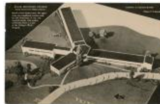
Studies Building Postcard (2014.8.1)