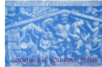
Bumper-Sticker Jubilation for Those Conversant With Both Redneck Lingo & The Glories of the Tympanum of the Pilgrimage Church of Sainte Foix at Conques (Aveyron): Conques If You Love Jesus (2012.4.4)