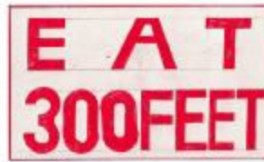
The Anthropophagites Get Down on a Barbecue Sign on Highway NC 107 South of Hamlet: Eat 300 Feet (2012.4.13)