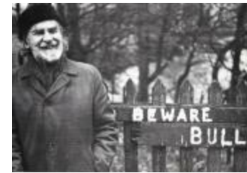
Basil Bunting, On His 80th Birthday, Offers Us Ancient, Excellent, Poetic Wisdom As He Stands By the River Rawthey, At the Millthrop Bridge, Sedbergh, Cumbria: Beware Bull (2012.4.15)