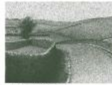
Sett-Piece: Cumbrian Greengrocer, Dragged Screaming Into Bloody Europe, Letters His Own Fookin' Sign: Brockley (2012.4.3)