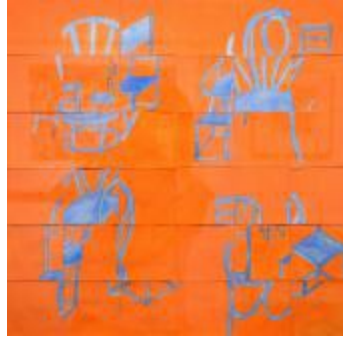
Musical Chairs (1995.10.1)