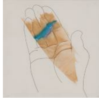
Bird in Hand (2021.60.2)