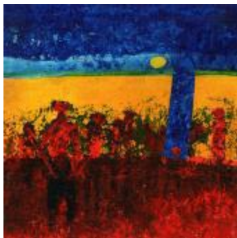
Love Feast 2 (1997.5.1)