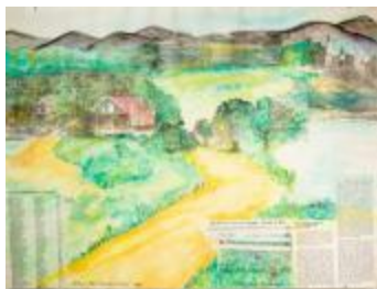
Untitled (Black Mountain College Histcollage) (1995.9.1)