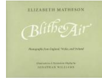
Blithe air : photographs from England, Wales, and Ireland (Jargon 112) (84318394)