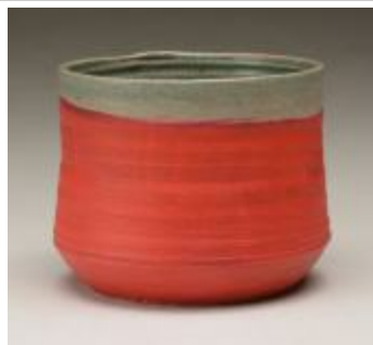
Untitled (Red Tea Bowl) (2008.12.4)