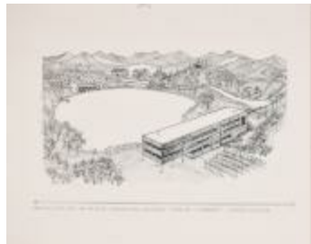
Recollection of Black Mountain College 1942-43 (1995.11.1)