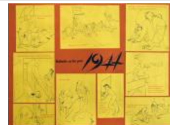
Footnotes on the Year 1944 (1995.5.1)