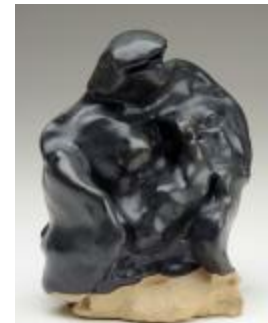
Black Madonna (2009.1.1)