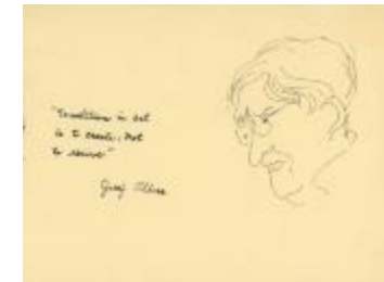
Portrait of Josef Albers (1995.20.1)