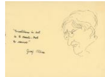
Portrait of Josef Albers (1995.20.1)