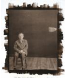
John Cage - Escaping the Frame (2015.12.1)