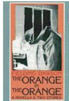
The orange in the orange : a novella & two stories (120032572)