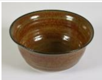
Untitled (Brown Bowl) (2008.12.3)