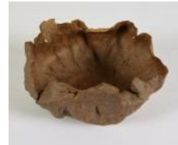
Untitled (Un glazed Pinch Bowl) (2008.12.2)