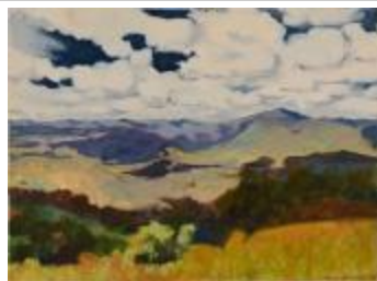
Blue Ridge Mountains (1995.23.1)