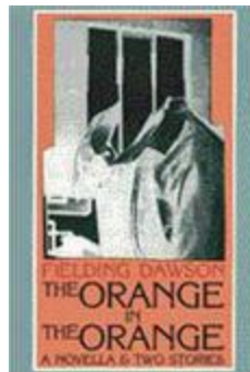
The orange in the orange : a novella & two stories (120032572)