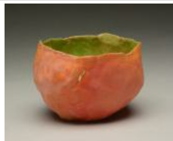
Peach Bowl (1995.27.1)