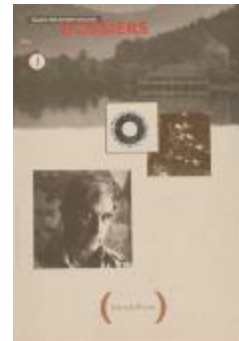
Imagining the landscape: Joseph Fiore's structures of rhythms and sentiment (Black Mountain College dossiers : no. 1)