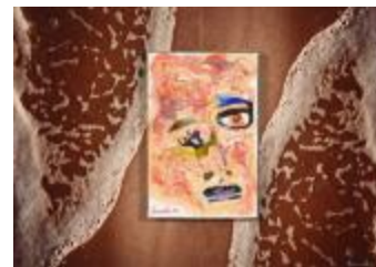
Ode to Ray Johnson (1996.9.4)