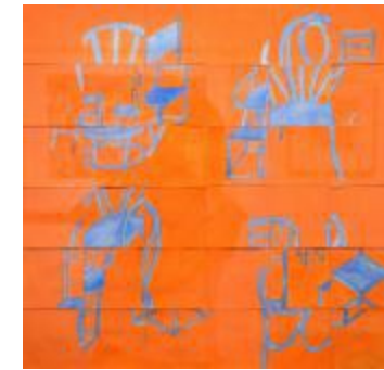
Musical Chairs (1995.10.1)