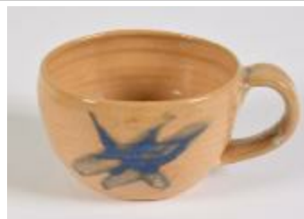
Untitled (Cup with Blue Design) (2008.12.5)