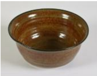
Untitled (Brown Bowl) (2008.12.3)