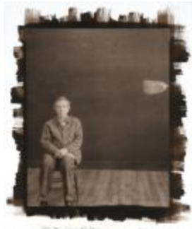
John Cage - Escaping the Frame (2015.12.1)