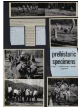
Prehistoric Specimens vs. Modern Neurotics: Sports at Black Mountain College (1995.16.1)