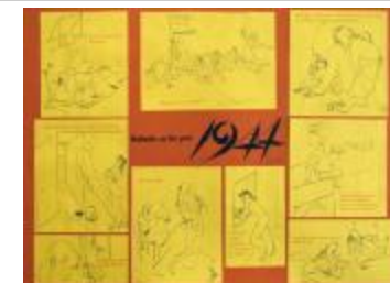
Footnotes on the Year 1944 (1995.5.1)