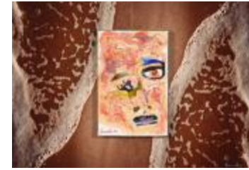
Ode to Ray Johnson (1996.9.4)