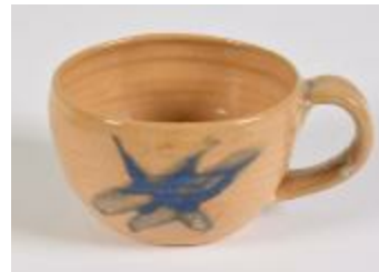
Untitled (Cup with Blue Design) (2008.12.5)