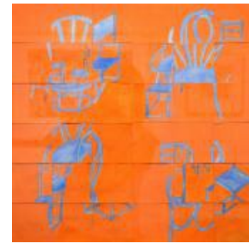
Musical Chairs (1995.10.1)