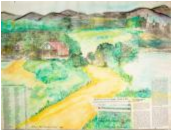
Untitled (Black Mountain College Histcollage) (1995.9.1)