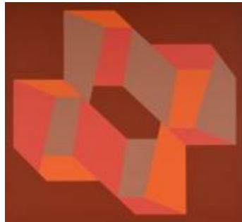
433 EV (2000.2.3)