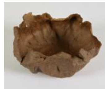
Untitled (Unglazed Pinch Bowl) (2008.12.2)