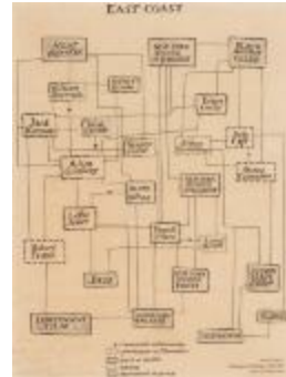
Sociogram of the Beats, 1950-1965 (2022.3.1)