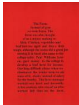
The Farm (1995.31.1)