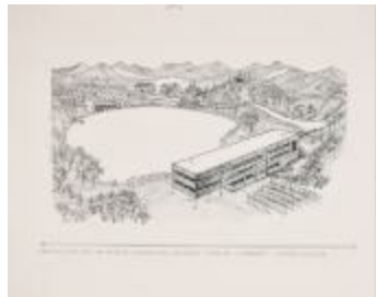
Recollection of Black Mountain College 1942-43 (1995.11.1)