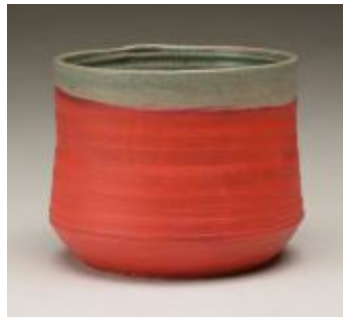
Untitled (Red Tea Bowl) (2008.12.4)