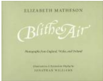
Blithe air : photographs from England, Wales, and Ireland (Jargon 112) (84318394)