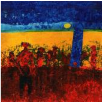
Love Feast 2 (1997.5.1)