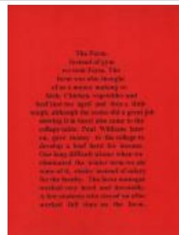
The Farm (1995.31.1)