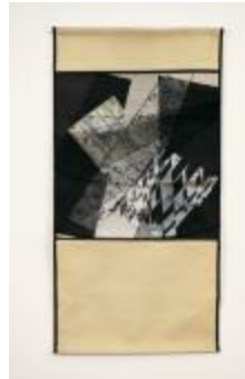
Path of Illumination #8 (2010.4.1)