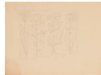
Untitled (Floral Design) (2013.17.13)