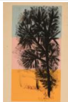
Untitled (Abstract) (2013.17.6)