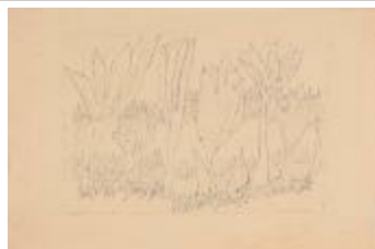
Untitled (Flowers/Abstract) (2013.17.3)