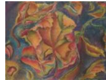
Leaf Conversation (2008.34.1)