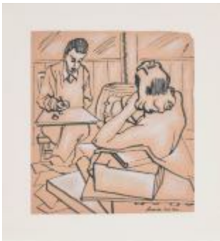
Kenneth Noland Drawing a Model at the Rue d'Assas Atelier of Instructor Ossip Zadkine (1996.9.2)