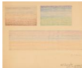
Sketches for Natl. Bankings & Trust, Bank Green Acres, Valley Stream (2013.16.21)