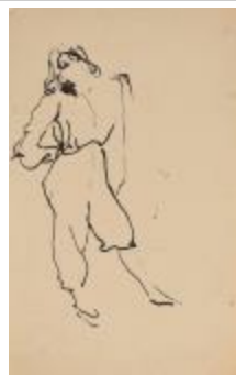
Untitled (Female Figure) (2013.17.4)