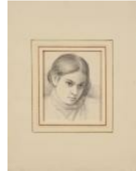
Untitled (Pencil Sketch Self Portrait) (2023.22.1)