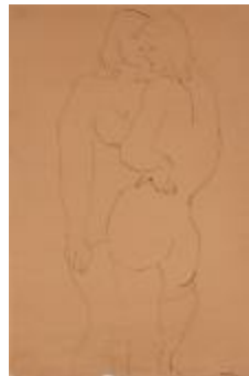
Two Women (2004.6.1)