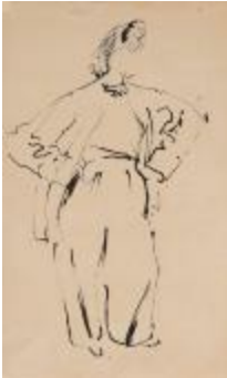
Untitled (Female Figure) (2013.17.9)