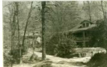
One of the Lodges on Campus (2003.7.1.13)