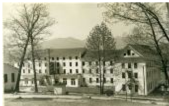
Rear area of Lee Hall (2003.7.1.04)