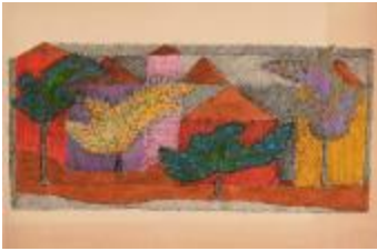
Untitled (Hillside Landscape) (2013.17.11)