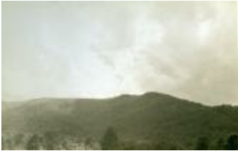
Mountain ranges in the Swannanoa Valley (2003.7.1.24)