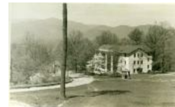
The Side of the YMCA Building (2003.7.1.07)