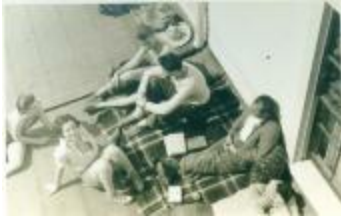
Students on the deck behind Lee Hall (2003.7.1.48)