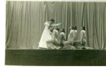
A traditional Greek production held outdoors (2003.7.1.71)