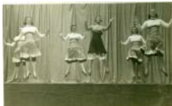
Outdoor stage performance (2003.7.1.65)