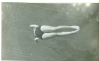
Student diving into Lake Eden (2003.7.1.32)