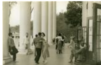
Dance on the porch of Robert E. Lee Hall (2003.7.1.18)