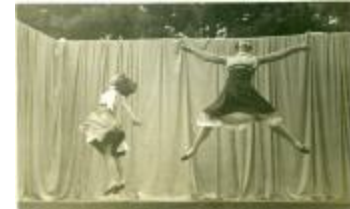
Outdoor stage performance (2003.7.1.63)