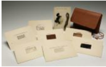
Fiber Samples for Anni Albers' Weaving Class (2017.10.1)