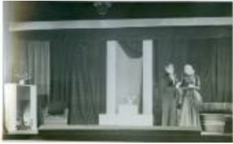
Post card of a Black Mountain College production (2003.7.1.56)