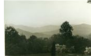
Setting of the College in the mountains on the slope of the Blue Ridge (2003.7.1.11)