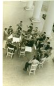
Black Mountain College Orchestra on the porch of Lee Hall (2003.7.1.14)