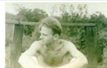
Student at Lake Eden (2003.7.1.43)