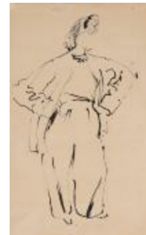
Untitled (Female Figure) (2013.17.9)