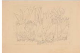
Untitled (Flowers/Abstract) (2013.17.3)