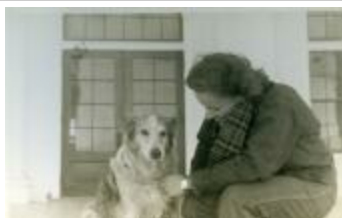
Student and dog in front of a rear entrance of Lee Hall (2003.7.1.40)