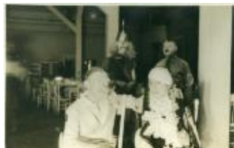
Costume party at the Lake Eden campus (2003.7.1.36)