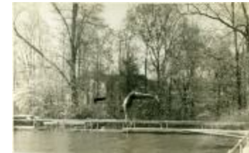
Student diving into Lake Eden (2003.7.1.31)