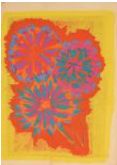
Untitled (Floral Abstract) (2013.17.7)