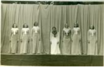
A traditional Greek production held outdoors (2003.7.1.72)