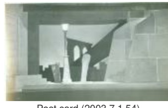
Post card (2003.7.1.54)