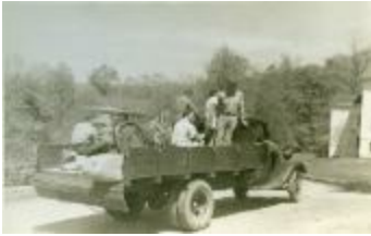
Black Mountain College work camp (2003.7.1.20)