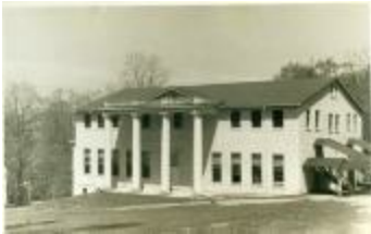
Back of the YMCA Building (2003.7.1.08)