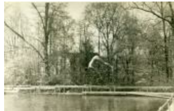
Student diving into Lake Eden (2003.7.1.30)