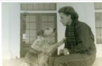
Student and dog in front of a rear entrance of Lee Hall (2003.7.1.41)