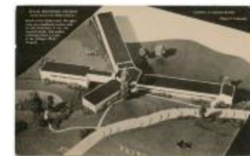
Studies Building Postcard (2014.8.1)