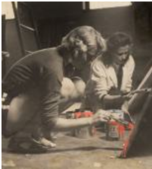
BMC Students Painting (2022.3.4)