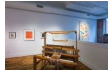
Shuttle-Craft Practical Loom from the Black Mountain College Weaving Workshop (2000.5.1)