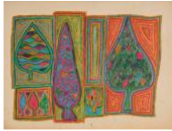
Untitled (Design) (2013.17.12)