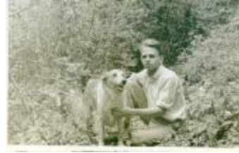
Student and dog on the Lake Eden property (2003.7.1.50)