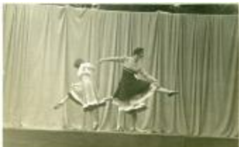
Outdoor stage performance (2003.7.1.64)