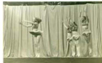
Outdoor stage performance (2003.7.1.66)