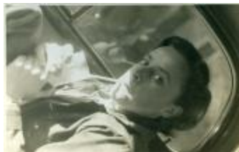
Student off-campus (2003.7.1.53)