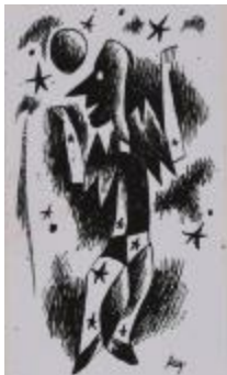
Postcard to Secunda (1996.9.5)