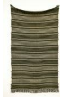
Dark Gray Throw (2006.20.2)