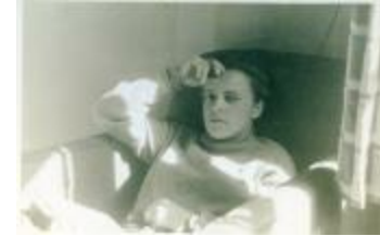
Student reading, probably in the South Lodge (men's dormitories) of the Lake Eden campus (2003.7.1.51)