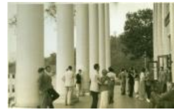
Dance on the porch of Robert E. Lee Hall (2003.7.1.19)