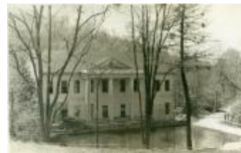
The Campus Dining Hall (2003.7.1.06)