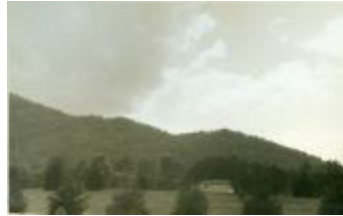
Mountain ranges in the Swannanoa Valley (2003.7.1.25)