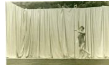
Outdoor stage performance (2003.7.1.67)