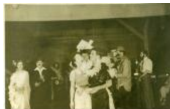
Costume party at the Lake Eden campus (2003.7.1.34)