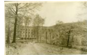
The path to Lee Hall (2003.7.1.03)