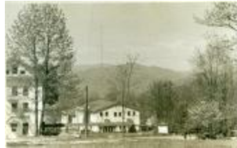
Side view of the YMCA building and the left corner of Lee Hall (2003.7.1.09)