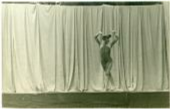
Outdoor stage performance (2003.7.1.68)