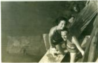
Students at Lake Eden (2003.7.1.44)