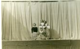
Outdoor stage performance (2003.7.1.61)