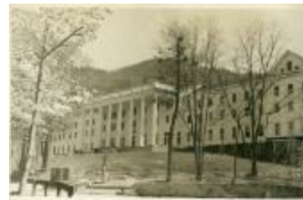
Robert E. Lee Hall (2003.7.1.02)