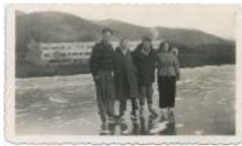
Ice Skating on Lake Eden (2000.3.1)