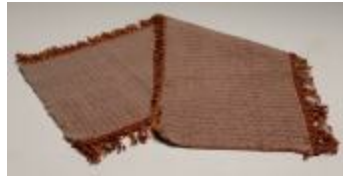
Upholstery Fabric (2021.55.1)