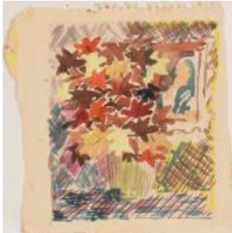
Untitled (Flowers in Pot) (2013.17.2)