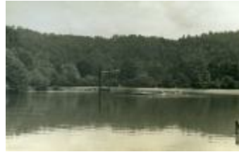
The artificially dammed Lake Eden (2003.7.1.26)