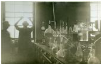
Black Mountain College chemistry lab (2003.7.1.16)