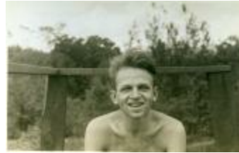
Student at Lake Eden (2003.7.1.46)