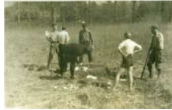
Black Mountain College work camp (2003.7.1.22)