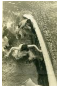
Student canoeing at Lake Eden (2003.7.1.29)