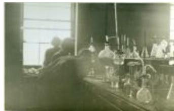
Black Mountain College chemistry lab (2003.7.1.17)