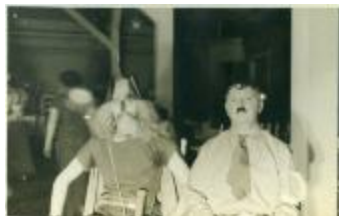
Costume party at the Lake Eden campus (2003.7.1.37)