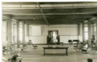
Lobby of Robert E. Lee Hall (2003.7.1.05)