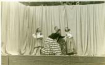
Outdoor stage performance (2003.7.1.60)