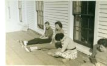
Students on the deck behind Lee Hall (2003.7.1.47)