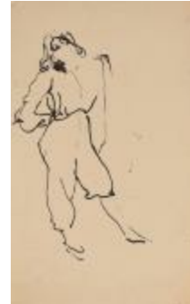
Untitled (Female Figure) (2013.17.4)