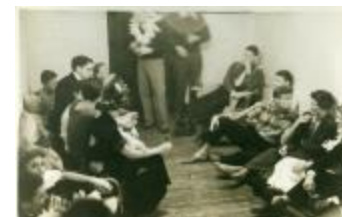
Costume party at the Lake Eden campus (2003.7.1.35)