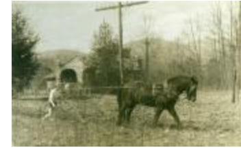
Black Mountain College work camp (2003.7.1.23)