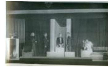
Post card of a Black Mountain College production (2003.7.1.55)