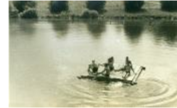
Students rafting at Lake Eden (2003.7.1.27)