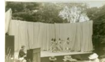
Outdoor stage performance (2003.7.1.59)