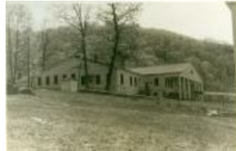
Side of the Campus Dining Hall (2003.7.1.10)