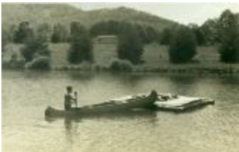
Student canoeing at Lake Eden (2003.7.1.28)