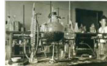
Black Mountain College chemistry lab (2003.7.1.15)