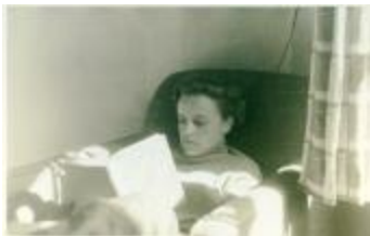
Student reading, probably in the South Lodge (men's dormitories) of the Lake Eden campus (2003.7.1.52)