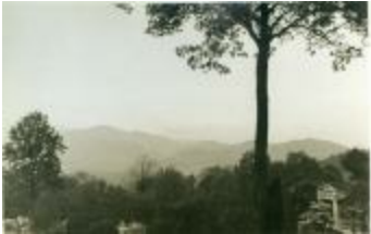
Mountain ranges in the Swannanoa Valley (2003.7.1.12)