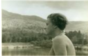
Student at Lake Eden (2003.7.1.45)