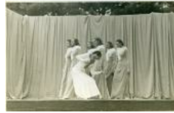
A traditional Greek production held outdoors (2003.7.1.70)