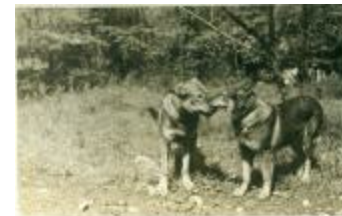
Dogs on the Lake Eden campus property. (2003.7.1.39)