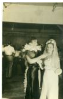
Costume party in the dining hall of the Lake Eden campus (2003.7.1.33)