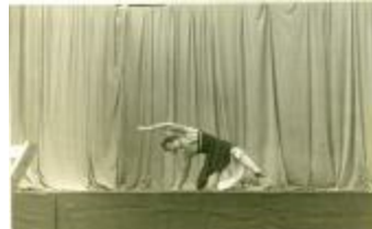
Outdoor stage performance (2003.7.1.62)