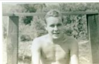
Student at Lake Eden (2003.7.1.42)