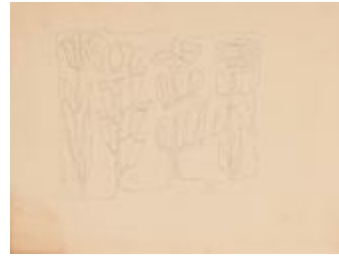
Untitled (Floral Design) (2013.17.13)