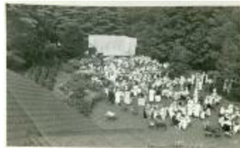
Post card of an outdoor stage performance (2003.7.1.57)