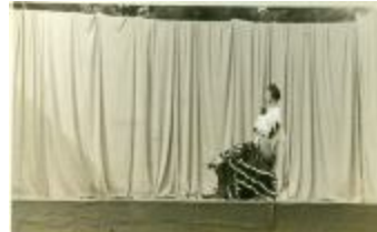
Outdoor stage performance (2003.7.1.58)