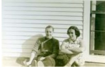
Students on the deck behind Lee Hall (2003.7.1.49)