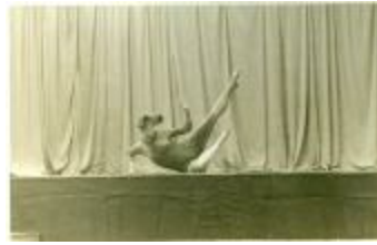
Outdoor stage performance (2003.7.1.69)