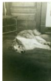
Dog on the floor of one of the buildings on the Lake Eden campus (2003.7.1.38)