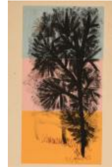
Untitled (Abstract) (2013.17.6)