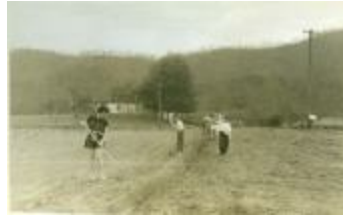
Black Mountain College work camp (2003.7.1.21)