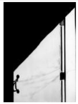
Quiet House Door (2018.8.1)