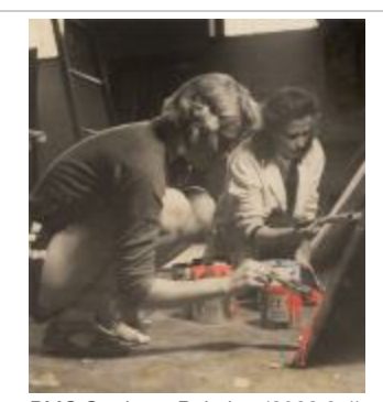
BMC Students Painting (2022.3.4)