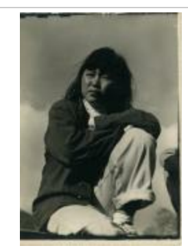
Ruth Asawa at Black Mountain College (2002.8.8)