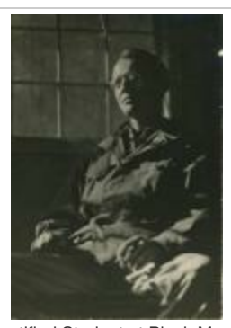
Unidentified Student at Black Mountain College (2002.8.9)