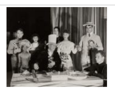
The Ruse of Medusa Production (1998.2.5)