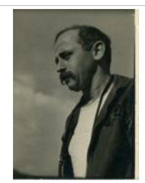
Ilya Bolotowsky at Black Mountain College (2002.8.7)