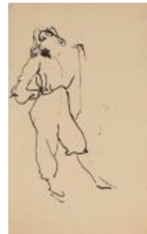
Untitled (Female Figure) (2013.17.4)