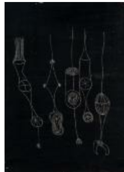
Magic Garden (2019.1.7)