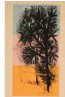
Untitled (Abstract) (2013.17.6)