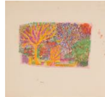
Untitled (Landscape) (2013.17.10)