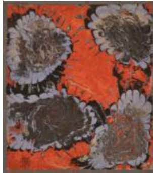
Sunset Flowers (2017.1.1)