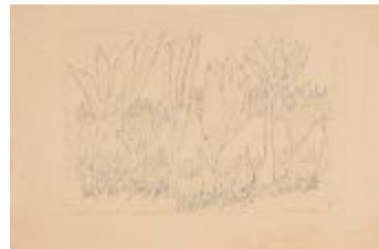
Untitled (Flowers/Abstract) (2013.17.3)