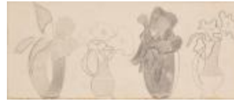
Untitled (Vase with Flowers) (2013.17.1)