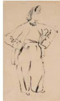
Untitled (Female Figure) (2013.17.9)