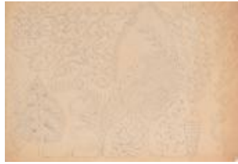
Untitled (Floral Abstract Design) (2013.17.8)