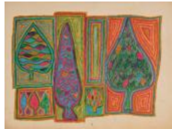
Untitled (Design) (2013.17.12)