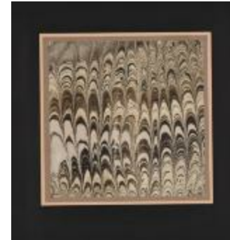
Untitled (Marbled Paper) (2013.9.1)