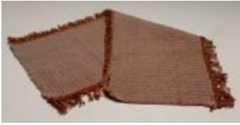
Upholstery Fabric (2021.55.1)