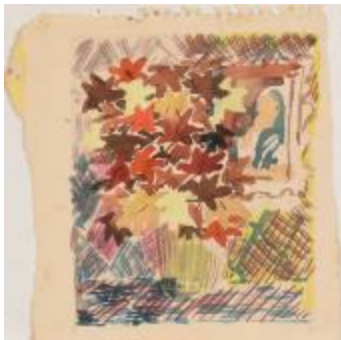
Untitled (Flowers in Pot) (2013.17.2)