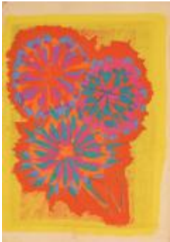
Untitled (Floral Abstract) (2013.17.7)