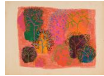
Untitled (Abstract) (2013.17.16)