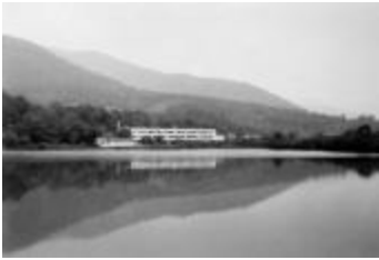
The Studies Building (2010.9.1)