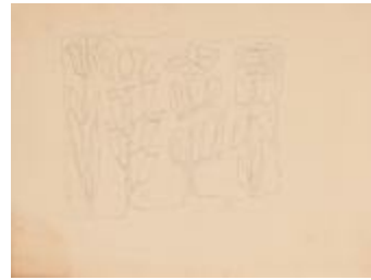
Untitled (Floral Design) (2013.17.13)