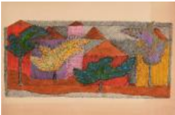
Untitled (Hillside Landscape) (2013.17.11)