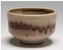
Untitled (Bowl) (2023.19.5)