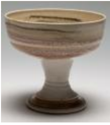
Untitled (Bowl with Stem) (2023.19.6)