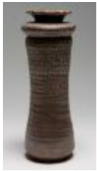
Untitled (Brown Vessel) (2023.19.2)