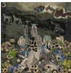
Tropism #5 (2017.7.1)