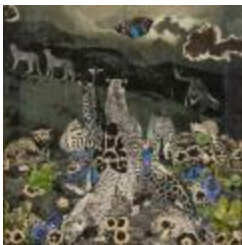
Tropism #5 (2017.7.1)