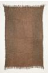
Mohair Throw (2013.2.13)