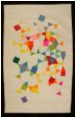
Untitled from the Geodesic series (2008.8.1)