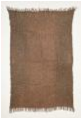
Mohair Throw (2013.2.13)