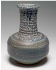
Untitled (Blue Vase with Extended Neck) (2023.19.3)