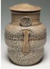
Untitled (Salt Glazed Lidded Jar) (2023.19.1)