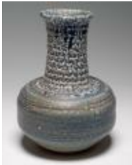
Untitled (Blue Vase with Extended Neck) (2023.19.3)