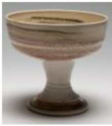
Untitled (Bowl with Stem) (2023.19.6)