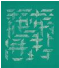
Double Impression III (2013.6.1)