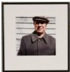
Harry Callahan, Providence, RI (1998.5.13)