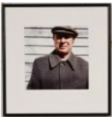
Harry Callahan, Providence, RI (1998.5.13)