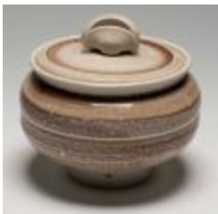
Lidded Bowl (2023.19.4)