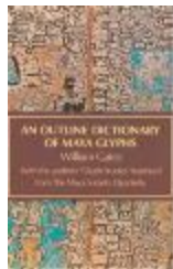
An outline dictionary of Maya glyphs, with a concordance and analysis of their relationships : with the author's "Glyph studies" reprinted from the Maya Society quarterly (176902301)