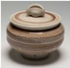
Lidded Bowl (2023.19.4)