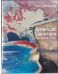
History of American ceramics : the studio potter (140007565)