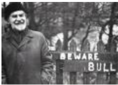
Basil Bunting, On His 80th Birthday, Offers Us Ancient, Excellent, Poetic Wisdom As He Stands By the River Rawthey, At the Millthrop Bridge, Sedbergh, Cumbria: Beware Bull (2012.4.15)