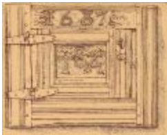
The Spice Cupboard (1687) In The Parlour At Corn Close Recalls The Most Diabolical Remark It's Heard During The First 300 Years (2012.4.18)