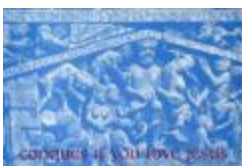
Bumper-Sticker Jubilation for Those Conversant With Both Redneck Lingo & The Glories of the Tympanum of the Pilgrimage Church of Sainte Foix at Conques (Aveyron): Conques If You Love Jesus (2012.4.4)