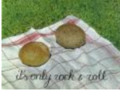
It's Only Rock & Roll (In Memoriam: Elvis Magritte) (2012.4.11)