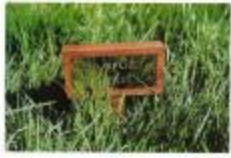
Et in Arcadia Ego: Homage to Garth MacVader and Any and All Down the Primrose Paths of Righteousness (Pompous Grass) (2012.4.10)