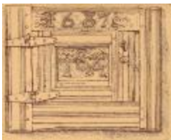
The Spice Cupboard (1687) In The Parlour At Corn Close Recalls The Most Diabolical Remark It's Heard During The First 300 Years (2012.4.18)