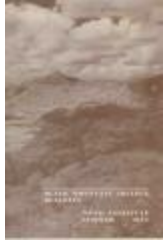
Black Mountain College Bulletin, Volume 3, Number 5: Second Music Institute (2002.7.2)