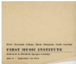
Black Mountain College First Music Institute [program] (2002.7.6)