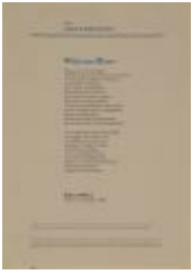
Welcome Home (2016.7.11)