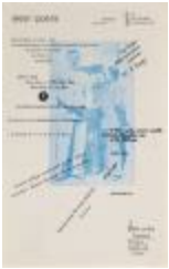
Green Poems (2016.7.3)