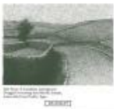
Sett-Piece: Cumbrian Greengrocer, Dragged Screaming Into Bloody Europe, Letters His Own Fookin' Sign: Brockley (2012.4.3)