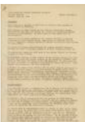
Black Mountain College Community Bulletin 5 (2002.7.4)