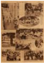
Cooperative Education New York Times Article, 1936 (1998.7.7)