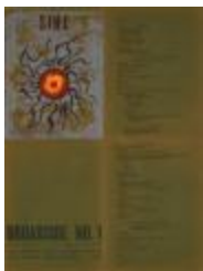
This (Broadside No. 1) (2008.22.1)