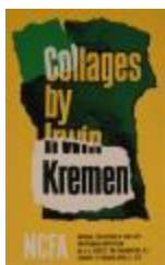
Collages by Irwin Kremen (2011.9.1)