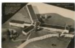
Studies Building Postcard (2014.8.1)