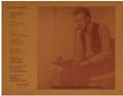
Oh, do you remember... (2016.7.4)