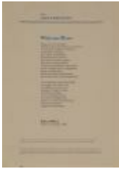
Welcome Home (2016.7.11)