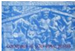
Bumper-Sticker Jubilation for Those Conversant With Both Redneck Lingo & The Glories of the Tympanum of the Pilgrimage Church of Sainte Foix at Conques (Aveyron): Conques If You Love Jesus (2012.4.4)