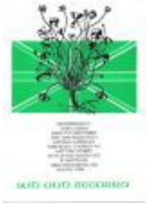
Wild Irish Oath, to Be Uttered When It Is Discovered that the Protestants & Roman Catholics Were Ready to Forget All and Turn Atheist, Until It Was Pointed Out by Whitehall They Would Both Lose Holiday Time...: Sod and Begorra (2012.4.5)