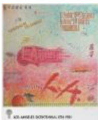
LA in Several Languages; And the Big Orange (2015.21.2)