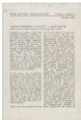
Black Mountain College Bulletin, Volume 3, Number 1: Arnold Schoenberg at Seventy (2002.7.3)