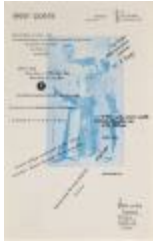
Green Poems (2016.7.3)