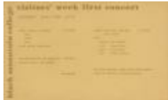
Visitors' Week First Concert Program (1998.7.8)