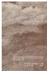
Black Mountain College Bulletin, Volume 3, Number 5: Second Music Institute (2002.7.2)