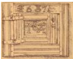
The Spice Cupboard (1687) In The Parlour At Corn Close Recalls The Most Diabolical Remark It's Heard During The First 300 Years (2012.4.18)