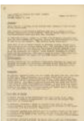
Black Mountain College Community Bulletin 6 (2002.7.5)