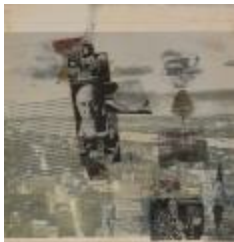
Poster of Senator Javits (2006.23.1)