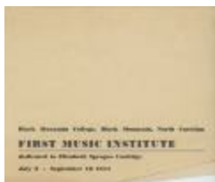
Black Mountain College First Music Institute [program] (2002.7.6)