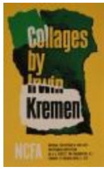
Collages by Irwin Kremen (2011.9.1)