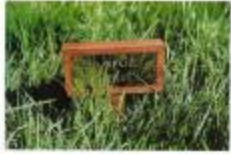
Et in Arcadia Ego: Homage to Garth MacVader and Any and All Down the Primrose Paths of Righteousness (Pompous Grass) (2012.4.10)