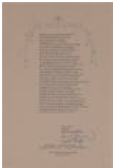
The Root Worker (2016.7.5)