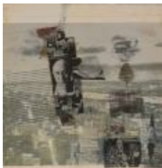
Poster of Senator Javits (2006.23.1)