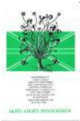
Wild Irish Oath, to Be Uttered When It Is Discovered that the Protestants & Roman Catholics Were Ready to Forget All and Turn Atheist, Until It Was Pointed Out by Whitehall They Would Both Lose Holiday Time....: Sod and Begorra (2012.4.5)