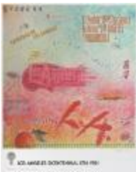
LA in Several Languages; And the Big Orange (2015.21.2)