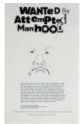
Wanted for Attempted Manhood (2014.13.2)