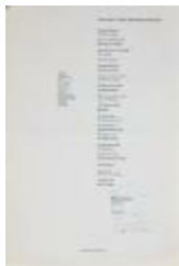
The Poem Called Alexander Hamilton (2016.7.8)