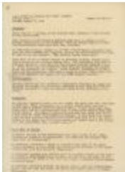
Black Mountain College Community Bulletin 6 (2002.7.5)