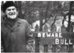
Basil Bunting, On His 80th Birthday, Offers Us Ancient, Excellent, Poetic Wisdom As He Stands By the River Rawthey, At the Millthrop Bridge, Sedbergh, Cumbria: Beware Bull (2012.4.15)