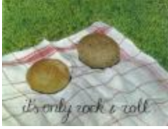
It's Only Rock & Roll (In Memoriam: Elvis Magritte) (2012.4.11)