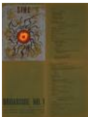
This (Broadside No. 1) (2008.22.1)