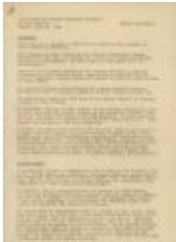
Black Mountain College Community Bulletin 5 (2002.7.4)