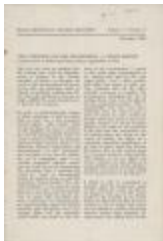
Black Mountain College Bulletin, Volume 3, Number 2: The Composer and the Interpreter (2002.7.1)