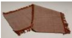
Upholstery Fabric (2021.55.1)