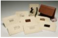
Fiber Samples for Anni Albers' Weaving Class (2017.10.1)