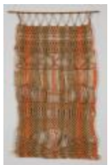
Wall Hanging (2021.56.1)