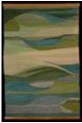
Bay Area (2007.8.1)