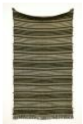
Dark Gray Throw (2006.20.2)