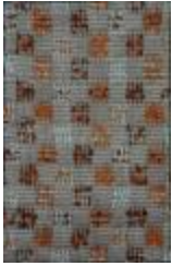
8 Harness Group Weaving Sample (1997.6.2)