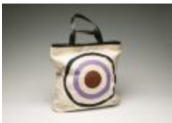
Coach Tote Bag with Target (2013.10.1)