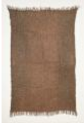
Mohair Throw (2013.2.13)