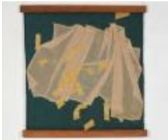
Untitled (Wall Hanging) (2013.16.13)