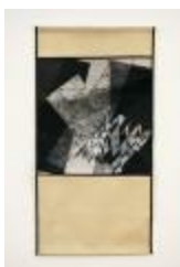
Path of Illumination #8 (2010.4.1)