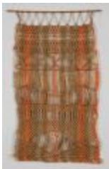
Wall Hanging (2021.56.1)