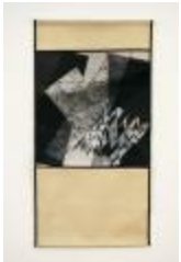
Path of Illumination #8 (2010.4.1)