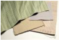
Nantucket Looms Fabric Samples (2013.2.14)