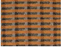
8 Harness Group Weaving Sample (1997.6.1)