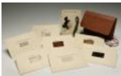
Fiber Samples for Anni Albers' Weaving Class (2017.10.1)