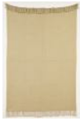
Cashmere Throw (2013.2.12)