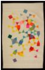
Untitled from the Geodesic series (2008.8.1)