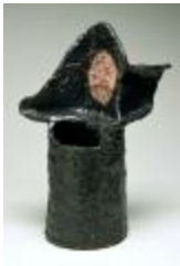
Folded Pot (2021.54.1)