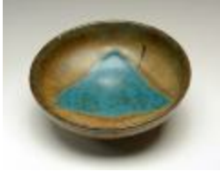
Flag Bowl (2008.6.1)