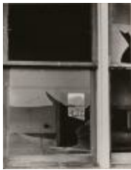
Magic Realism (2015.23.1)