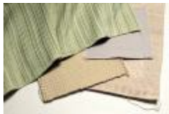
Nantucket Looms Fabric Samples (2013.2.14)