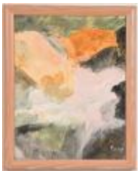
Dry Bear Creek (2013.16.12)