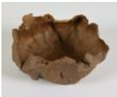
Untitled (Unglazed Pinch Bowl) (2008.12.2)