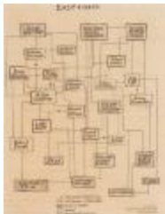
Sociogram of the Beats, 1950-1965 (2022.3.1)