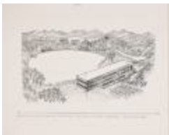
Recollection of Black Mountain College 1942-43 (1995.11.1)