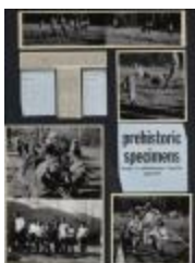
Prehistoric Specimens vs. Modern Neurotics: Sports at Black Mountain College (1995.16.1)