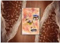
Ode to Ray Johnson (1996.9.4)