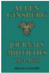
Journals mid-fifties, 1954-1958 (117607509)