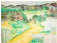
Untitled (Black Mountain College Histcollage) (1995.9.1)