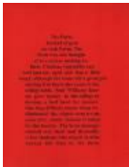
The Farm (1995.31.1)