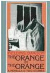
The orange in the orange : a novella & two stories (120032572)