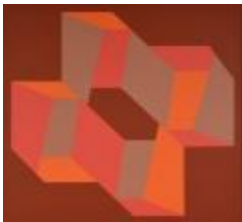
433 EV (2000.2.3)