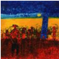
Love Feast 2 (1997.5.1)