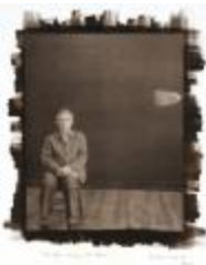
John Cage - Escaping the Frame (2015.12.1)