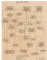
Sociogram of the Beats, 1950-1965 (2022.3.1)