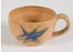
Untitled (Cup with Blue Design) (2008.12.5)