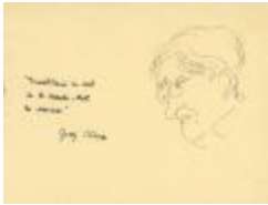
Portrait of Josef Albers (1995.20.1)