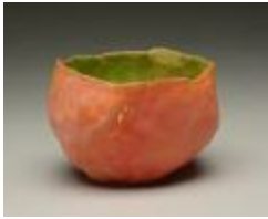
Peach Bowl (1995.27.1)