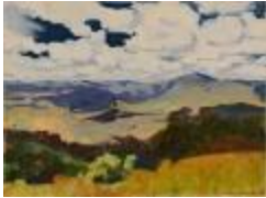
Blue Ridge Mountains (1995.23.1)