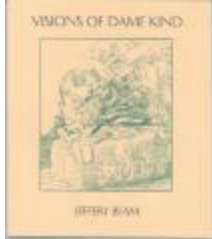
Visions of dame kind (Jargon 113) (84318497)