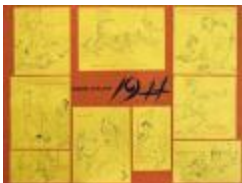
Footnotes on the Year 1944 (1995.5.1)