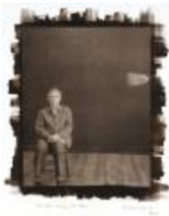
John Cage - Escaping the Frame (2015.12.1)