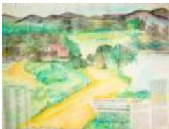
Untitled (Black Mountain College Histcollage) (1995.9.1)