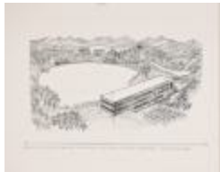
Recollection of Black Mountain College 1942-43 (1995.11.1)