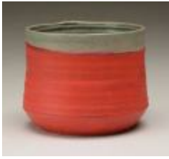
Untitled (Red Tea Bowl) (2008.12.4)