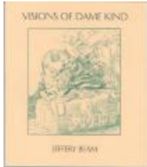
Visions of dame kind (Jargon 113) (84318497)