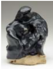
Black Madonna (2009.1.1)