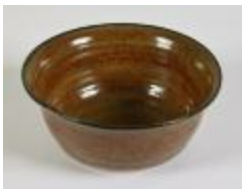
Untitled (Brown Bowl) (2008.12.3)