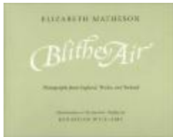
Blithe air : photographs from England, Wales, and Ireland (Jargon 112) (84318394)