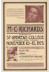
M.C. Richards in Residence at St. Andrews College, Laurinburg, North Carolina, November 10 - 15, 1975 (2011.10.1)