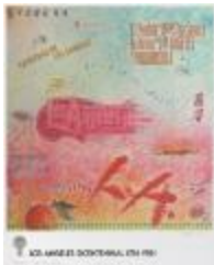
LA in Several Languages; And the Big Orange (2015.21.2)