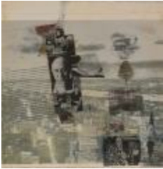
Poster of Senator Javits (2006.23.1)