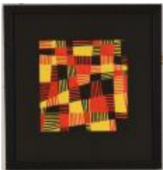
Color Study (1997.6.5)