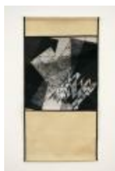
Path of Illumination #8 (2010.4.1)