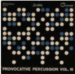
Cover Design for Provocative Percussion, Volume 3 (2016.1.5)