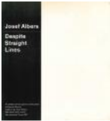
Josef Albers : despite straight lines; an analysis of his graphic constructions (118610288)