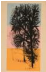
Untitled (Abstract) (2013.17.6)