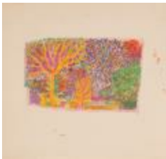
Untitled (Landscape) (2013.17.10)