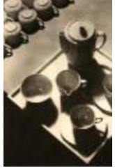
Coffee Dishes (Kaffeegeschirr) (2019.3.5)