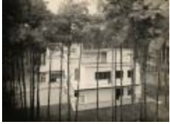
Masters' House, Bauhaus Dessau (2019.3.6)