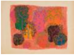
Untitled (Abstract) (2013.17.16)