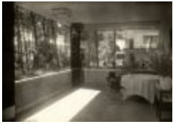
Masters' House Interior (2019.3.8)