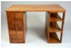
Desk for Black Mountain College Students (2005.11.1)