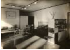
Masters' House Interior (2019.3.7)