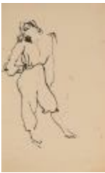
Untitled (Female Figure) (2013.17.4)