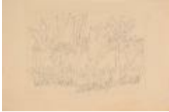
Untitled (Flowers/Abstract) (2013.17.3)