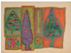
Untitled (Design) (2013.17.12)