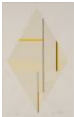
White Diamond (2005.15.1)