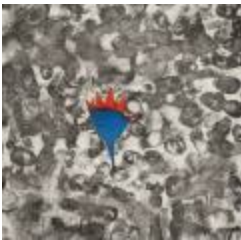
Leaf Hand (2021.60.3)