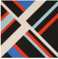
Black Diamond (2007.5.1)