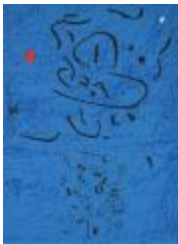
Red Moon, White Sun (2008.24.1)