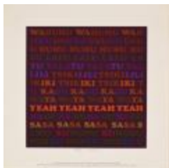
A Chorale* of Cherokee Night Music As Heard Through an Open Window in Summer Long Ago (2007.4.5)