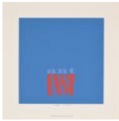
Meanwhile, Down at the Formicary, Time Flies (2007.4.2)