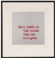
Snuffy Smith's Colossal Maw From War-Woman Dell, Georgia: More Mouth on That Woman Than Ass on a Goose (2007.4.3)