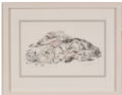
Prismatic Mountain (2017.1.6)