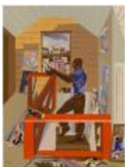
In the Studio (2021.38.1)