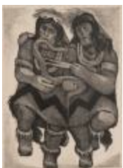
Indian Snake Dance (2021.60.5)