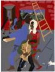
Right of Way (2021.59.2)