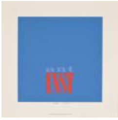
Meanwhile, Down at the Formicary, Time Flies (2007.4.2)