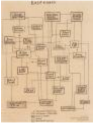
Sociogram of the Beats, 1950-1965 (2022.3.1)