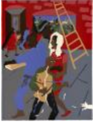
Right of Way (2021.59.2)