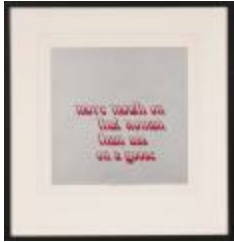
Snuffy Smith's Colossal Maw From War-Woman Dell, Georgia: More Mouth on That Woman Than Ass on a Goose (2007.4.3)