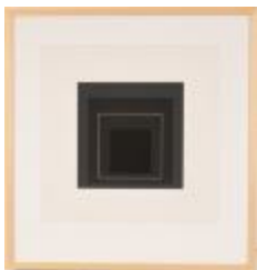
Gray Instrumentation I (2008.29.1)