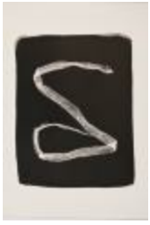
Serpents #10 (2019.22.45)