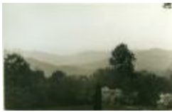
Setting of the College in the mountains on the slope of the Blue Ridge (2003.7.10)