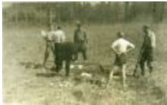
Black Mountain College work camp (2003.7.21)