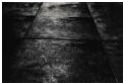
Wet Sidewalk, 5th Ave, NYC (1995.14.6)