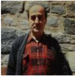
Stefan Wolpe, Black Mountain College (1998.5.25)