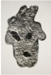
Geo Series #38 (2019.22.17)