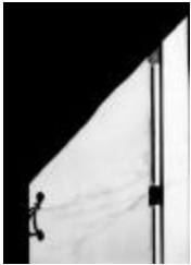
Quiet House Door (2018.8.1)