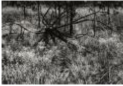
Untitled (Fallen Tree) (1995.14.1)