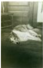
Dog on the floor of one of the buildings on the Lake Eden campus (2003.7.37)