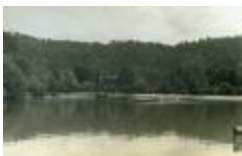
The artificially dammed Lake Eden (2003.7.25)