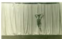
Outdoor stage performance (2003.7.67)