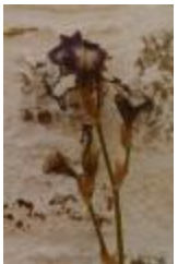
Untitled (Iris) (2013.2.7)