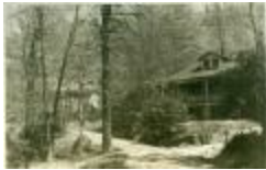
One of the lodges on the Lake Eden Campus (2003.7.12)