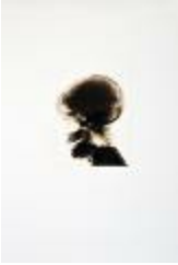
Light Memory #1 (2019.22.20)