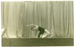
Outdoor stage performance (2003.7.61)