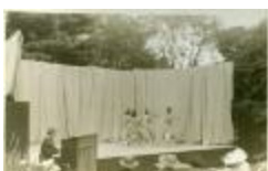
Outdoor stage performance (2003.7.58)