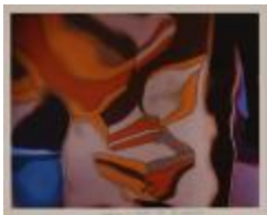
Reflections on Mylar (2002.8.3)