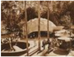
Fuller Geodesic Dome for Children's Theater, San Diego, California (2015.28.1)