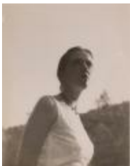
Dorothea Rockburne (2008.10.1)