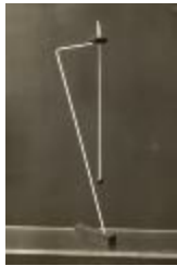
Balance Study with Loosely Suspended Pendulum (Gleichgewichtskonstruktion mit einem locker aufgehängten pendel) (2019.3.2)