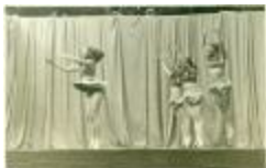
Outdoor stage performance (2003.7.65)