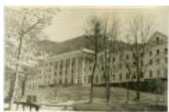
Robert E. Lee Hall (2003.7.1)