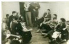
Costume party at the Lake Eden campus (2003.7.34)