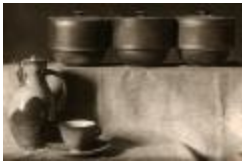
Cocoa Pot and Cup and Storage Containers (2019.3.9)