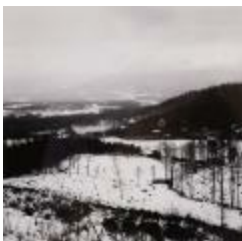
Landscape Near Lake Eden in the Snow (2016.24.1)