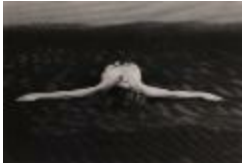
Flying Sand Nude (1995.14.3)