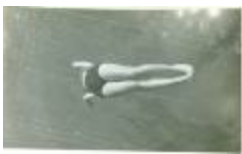
Student diving into Lake Eden (2003.7.31)