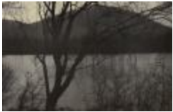
Lake Eden and Mae West (2010.5.1)