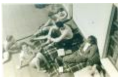
Students on the deck behind Lee Hall (2003.7.47)