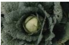
Untitled (Cabbage) (2013.2.9)