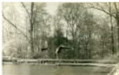
Student diving into Lake Eden (2003.7.30)