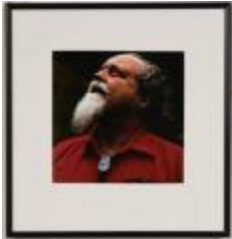
Lou Harrison, Marin County, CA (1998.5.29)