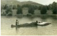
Student canoeing at Lake Eden (2003.7.27)