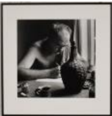
Charles Olson Writing The Maximus Poems (1998.5.3)