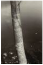
Maple/Lake Eden (2010.5.6)