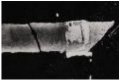
Traffic Lane, 96th St. and Madison Ave, NYC (1995.14.4)