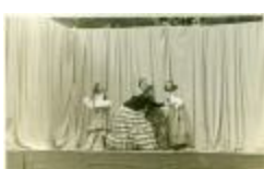
Outdoor stage performance (2003.7.59)