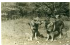
Dogs on the Lake Eden campus property. (2003.7.38)