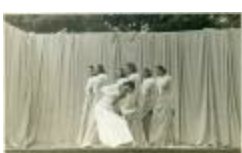
A traditional Greek production held outdoors (2003.7.69)