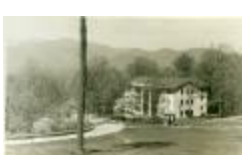
The side of the YMCA building (2003.7.6)