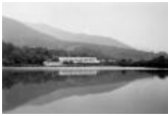
The Studies Building (2010.9.1)