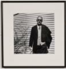
Charles Olson, Black Mountain College (1998.5.8)