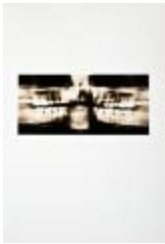
Light Memory #6 (2019.22.37)