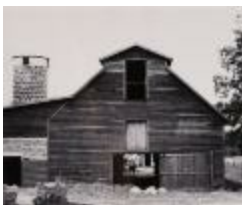
Barn and Silo with Cow in Doorway (2016.24.3)