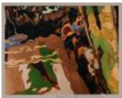
Reflections on Mylar (2002.8.2)