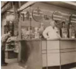
Times Square (2008.32.1)