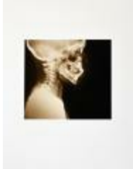
Light Memory #8 (2019.22.68)