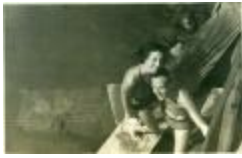
Students at Lake Eden (2003.7.43)