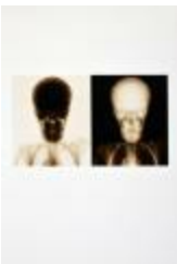
Light Memory #3 (2019.22.34)