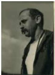
Ilya Bolotowsky at Black Mountain College (2002.8.7)