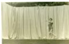
Outdoor stage performance (2003.7.66)