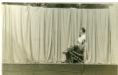
Outdoor stage performance (2003.7.57)