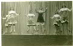
Outdoor stage performance (2003.7.64)