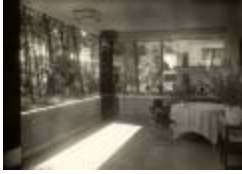
Masters' House Interior (2019.3.8)