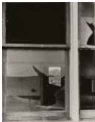
Magic Realism (2015.23.1)