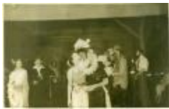
Costume party at the Lake Eden campus (2003.7.33)