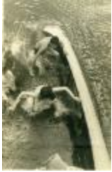
Student canoeing at Lake Eden (2003.7.28)