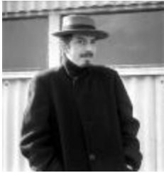
Portrait of the Artist (Robert Creeley) As a Spanish Assassin (1998.5.6)