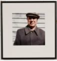
Harry Callahan, Providence, RI (1998.5.13)