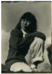
Ruth Asawa at Black Mountain College (2002.8.8)