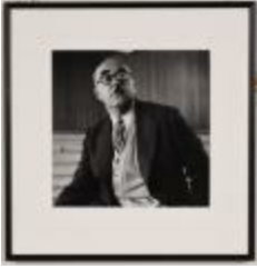
Charles Olson, Black Mountain College (1998.5.4)