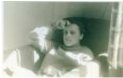
Student reading, probably in the South Lodge (men's dormitories) of the Lake Eden campus (2003.7.50)