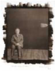
John Cage - Escaping the Frame (2015.12.1)