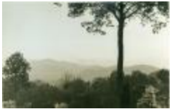
Mountain ranges in the Swannanoa Valley (2003.7.11)