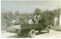
Black Mountain College work camp (2003.7.19)