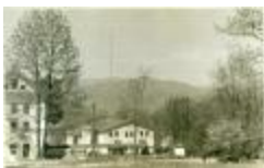
Side view of the YMCA building and the left corner of Lee Hall (2003.7.9)