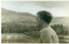
Student at Lake Eden (2003.7.44)