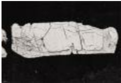
Untitled (Paint on Pavement) (1995.14.5)