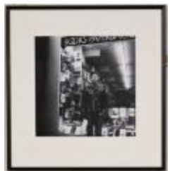
Untitled (Ray Johnson Outside a Bookstore) (2010.21.1)