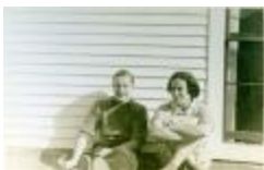
Students on the deck behind Lee Hall (2003.7.48)