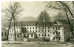
Rear area of Lee Hall (2003.7.3)