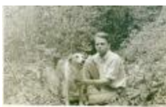
Student and dog on the Lake Eden property (2003.7.49)