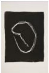
Serpents #3 (2019.22.43)