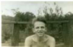
Student at Lake Eden (2003.7.45)