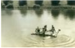
Students rafting at Lake Eden (2003.7.26)