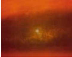
The Wheat Field (1995.25.1)