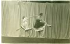
Outdoor stage performance (2003.7.63)