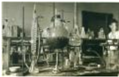
Black Mountain College chemistry lab (2003.7.14)