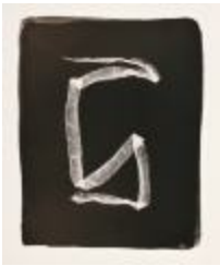
Serpents #4 (2019.22.47)