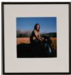
Francine du Plessix Gray, Cornwall Bridge, CT (1998.5.18)