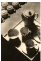
Coffee Dishes (Kaffeegeschirr) (2019.3.5)