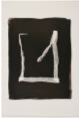
Serpents #8 (2019.22.49)