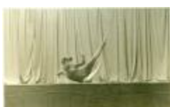
Outdoor stage performance (2003.7.68)