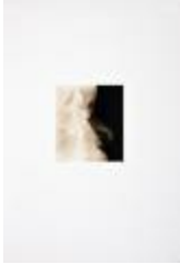
Light Memory #5 (2019.22.36)