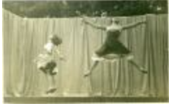
Outdoor stage performance (2003.7.62)