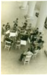
Black Mountain College Orchestra on the porch of Lee Hall (2003.7.13)