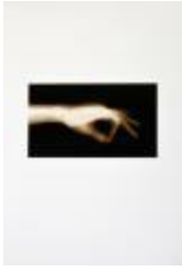
Light Memory #4 (2019.22.35)