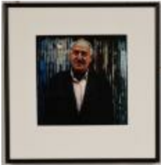
Edward Dahlberg, NYC (1998.5.27)