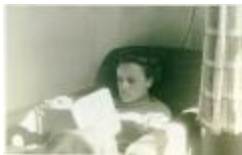
Student reading, probably in the South Lodge (men's dormitories) of the Lake Eden campus (2003.7.51)