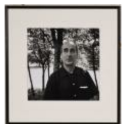
Stefan Wolpe, Black Mountain College (1998.5.12)