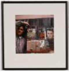
Robert Duncan with Portrait by Jess, San Fransisco (1998.5.19)