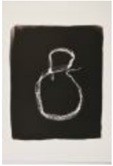
Serpents #7 (2019.22.48)