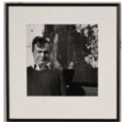
Robert Duncan, San Francisco (1998.5.10)