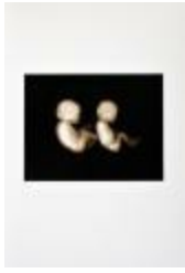
Light Memory #7 (2019.22.67)