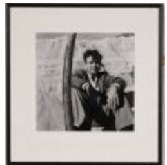
Robert Duncan, Point Lobos (1998.5.11)