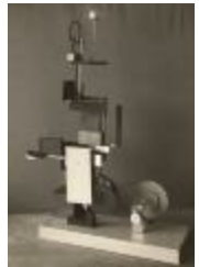
Study of a Mechanical Window Sculpture (Studie su einer mechnischen schaufensterplastik) (2019.3.4)