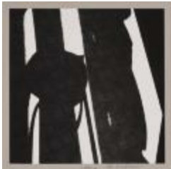
Untitled Part I (2002.8.11)