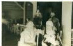
Costume party at the Lake Eden campus (2003.7.35)