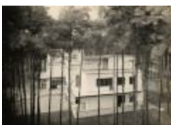
Masters' House, Bauhaus Dessau (2019.3.6)