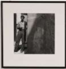
Robert Creeley, Banyalbufar, Mallorca (1998.5.9)