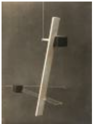
Floating Plastic: Illusionistic (Schwebende Plastik: Illusionistisch) (2019.3.3)