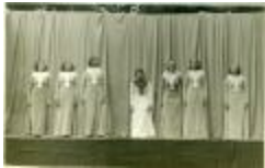
A traditional Greek production held outdoors (2003.7.71)