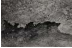
Hokusai's Wave Winding Up (1995.14.2)