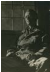
Unidentified Student at Black Mountain College (2002.8.9)