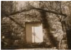
The Quiet House (2008.28.1)