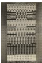
Bauhaus Textile (2019.3.13)