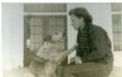
Student and dog in front of a rear entrance of Lee Hall (2003.7.40)