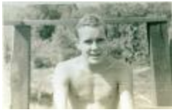
Student at Lake Eden (2003.7.41)