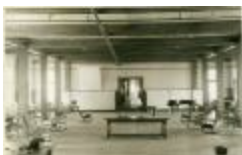
Lobby of Robert E. Lee Hall (2003.7.4)