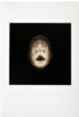
Light Memory #2 (2019.22.33)