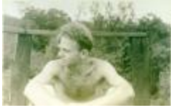
Student at Lake Eden (2003.7.42)