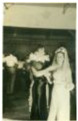
Costume party in the dining hall of the Lake Eden campus (2003.7.32)