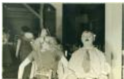
Costume party at the Lake Eden campus (2003.7.36)