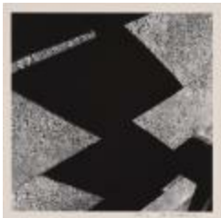
Untitled part II (2002.8.12)