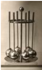
Tea Infuser Set (2019.3.11)