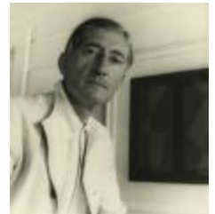
Josef Albers, Black Mountain College, North Carolina, Summer 1944 (PG2020.34.1)