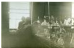
Black Mountain College chemistry lab (2003.7.16)