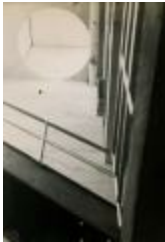
Black Mountain College Stairwell in Studies Building with Mailboxes (2008.26.1)