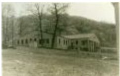
The side of the campus dining hall (2003.7.8)