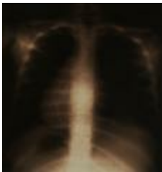
Earliest Brown Print #13 (2019.22.5)