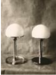
Bauhaus Table Lamps (2019.3.15)