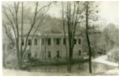
The campus dining hall (2003.7.5)