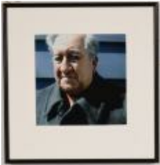
Aaron Siskind (1998.5.28)