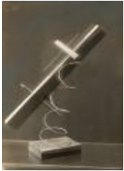
Floating Plastic: Illusionistic (Schwebende Plastik: Illusionistisch) (2019.3.1)