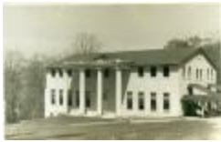
The back of the YMCA building (2003.7.7)