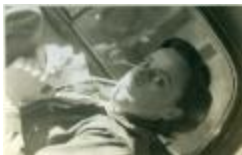
Student off-campus (2003.7.52)