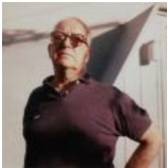
Buckminster Fuller, Carbondale, IL (1998.5.17)