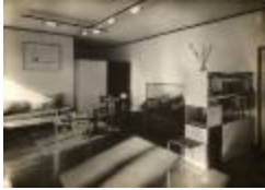
Masters' House Interior (2019.3.7)