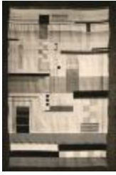
Wall Hanging (2019.3.14)