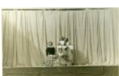
Outdoor stage performance (2003.7.60)