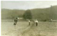
Black Mountain College work camp (2003.7.20)