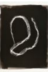
Serpents #1 (2019.22.44)