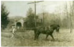
Black Mountain College work camp (2003.7.22)