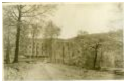
The path to Lee Hall (2003.7.2)