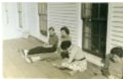
Students on the deck behind Lee Hall (2003.7.46)