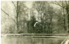
Student diving into Lake Eden (2003.7.29)