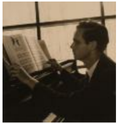
Lou Harrison, Music Hut, Black Mountain College (1998.5.5)