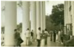
Dance on the porch of Robert E. Lee Hall (2003.7.18)