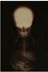
Earliest Brown Print #32 (2019.22.4)