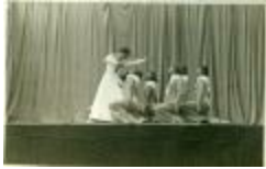
A traditional Greek production held outdoors (2003.7.70)