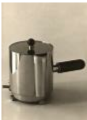
Electric Tea Kettle, stainless steel (2019.3.12)