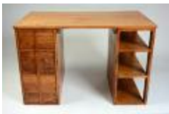
Desk for Black Mountain College Students (2005.11.1)