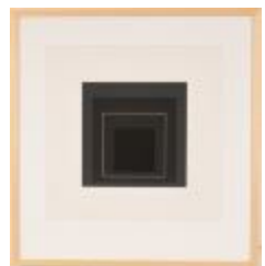
Gray Instrumentation I (2008.29.1)