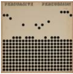
Cover Design for Persuasive Percussion (2016.1.1)