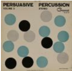
Cover Design for Persuasive Percussion, Volume III (2016.1.2)