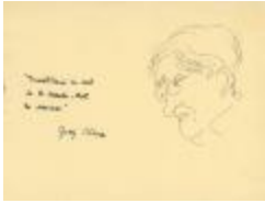
Portrait of Josef Albers (1995.20.1)