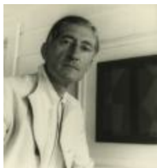
Josef Albers, Black Mountain College, North Carolina, Summer 1944 (PG2020.34.1)