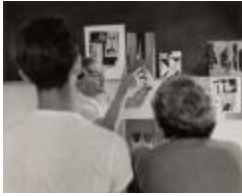
Josef Albers' Color Class (1998.2.2)