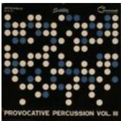
Cover Design for Provocative Percussion, Volume 3 (2016.1.5)