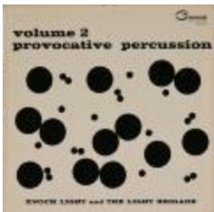
Cover Design for Provocative Percussion, Volume 2: Enoch Light and the Light Brigade (2016.1.4)