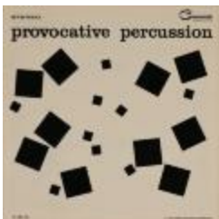
Cover Design for Provocative Percussion, Volume 1 (2016.1.3)