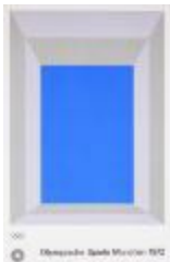
Kinetic Window (1972 Olympic Games, Munich) (2008.23.1)