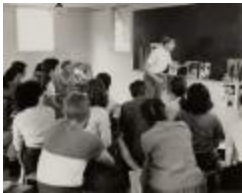
Josef Albers' Color Class (1998.2.4)