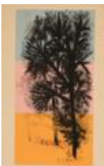
Untitled (Abstract) (2013.17.6)