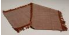
Upholstery Fabric (2021.55.1)