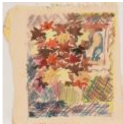
Untitled (Flowers in Pot) (2013.17.2)