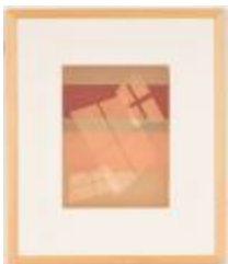
Three Lights Falling on a Surface (Exercise in Transparency) (2010.6.2)