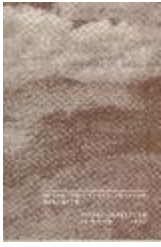
Black Mountain College Bulletin, Volume 3, Number 5: Second Music Institute (2002.7.2)