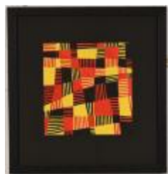
Color Study (1997.6.5)