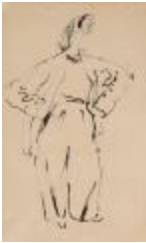
Untitled (Female Figure) (2013.17.9)