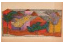
Untitled (Hillside Landscape) (2013.17.11)