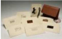
Fiber Samples for Anni Albers' Weaving Class (2017.10.1)