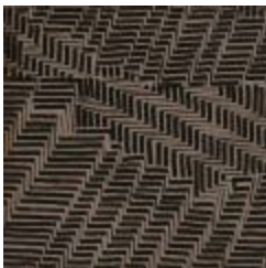
Design Study (1997.6.4)