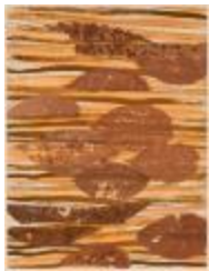
Leaf Study (1997.6.3)