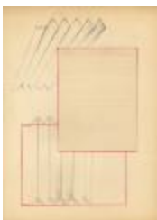
Folded Paper Study for Josef Albers' Course (2010.6.1)