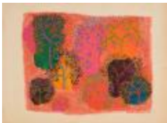
Untitled (Abstract) (2013.17.16)