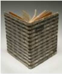
Weaving and Bookbinding for the Cover of Johannes Brahms: Fifty Selected Songs (2013.12.1)