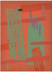
Study in Color Dissonance (2010.6.3)