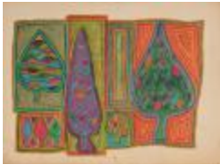
Untitled (Design) (2013.17.12)