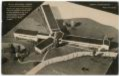
Studies Building Postcard (2014.8.1)