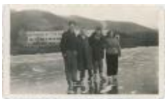
Ice Skating on Lake Eden (2000.3.1)