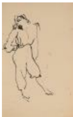
Untitled (Female Figure) (2013.17.4)