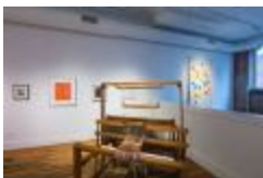
Shuttle-Craft Practical Loom from the Black Mountain College Weaving Workshop (2000.5.1)