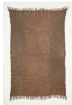
Mohair Throw (2013.2.13)