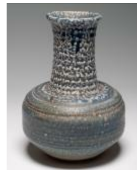
Untitled (Blue Vase with Extended Neck) (2023.19.3)