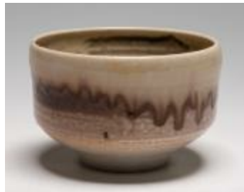
Untitled (Bowl) (2023.19.5)