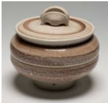
Lidded Bowl (2023.19.4)