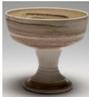
Untitled (Bowl with Stem) (2023.19.6)