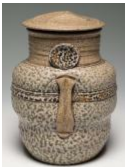
Untitled (Salt Glazed Lidded Jar) (2023.19.1)