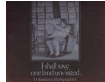
I shall save one land unvisited. Eleven southern photographers, selected by Jonathan Williams (84319461)