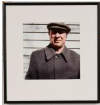
Harry Callahan, Providence, RI (1998.5.13)