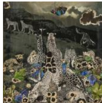
Tropism #5 (2017.7.1)