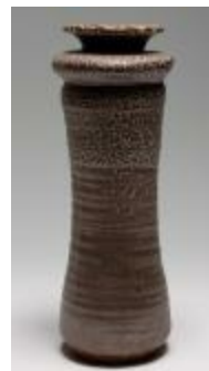
Untitled (Brown Vessel) (2023.19.2)