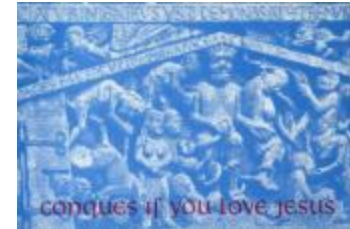
Bumper-Sticker Jubilation for Those Conversant With Both Redneck Lingo & The Glories of the Tympanum of the Pilgrimage Church of Sainte Foix at Conques (Aveyron): Conques If You Love Jesus (2012.4.4)