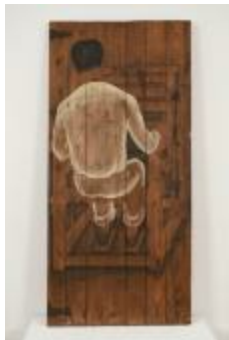
Weaving Workshop Door (2020.28.1)