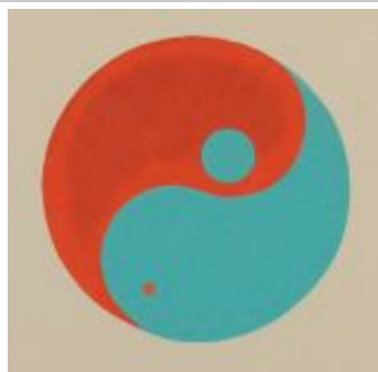
Untitled (Color Study: Red and Blue Yin Yang Design) (2023.22.5)