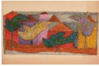
Untitled (Hillside Landscape) (2013.17.11)