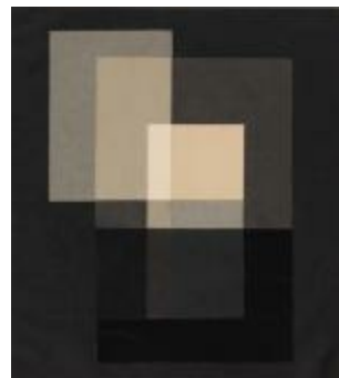
Untitled (Color Study: Black, Gray, Tan) (2023.22.7)