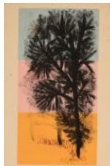
Untitled (Abstract) (2013.17.6)