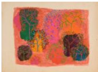
Untitled (Abstract) (2013.17.16)