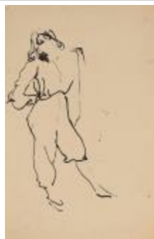
Untitled (Female Figure) (2013.17.4)