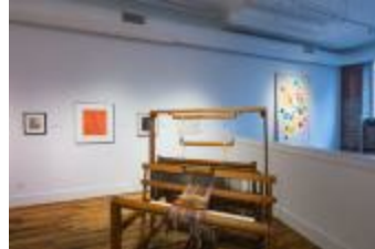
Shuttle-Craft Practical Loom from the Black Mountain College Weaving Workshop (2000.5.1)