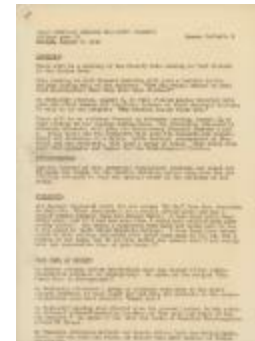
Black Mountain College Community Bulletin 6 (2002.7.5)