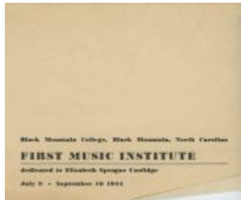
Black Mountain College First Music Institute [program] (2002.7.6)