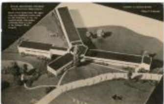
Studies Building Postcard (2014.8.1)