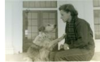
Student and dog at Robert E. Lee Hall (2003.7.1.41)