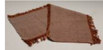
Upholstery Fabric (2021.55.1)