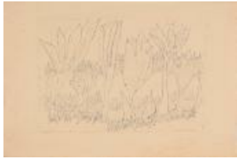
Untitled (Flowers/Abstract) (2013.17.3)