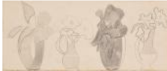
Untitled (Vase with Flowers) (2013.17.1)