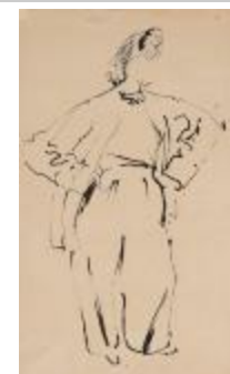
Untitled (Female Figure) (2013.17.9)