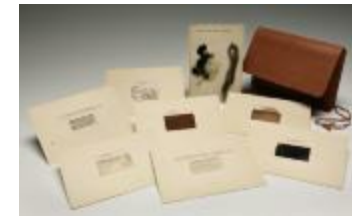
Fiber Samples for Anni Albers' Weaving Class (2017.10.1)