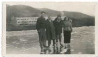
Ice Skating on Lake Eden (2003.9.2)