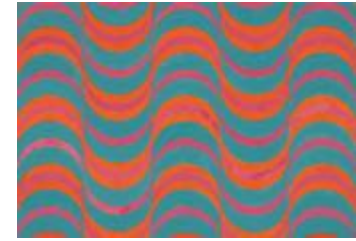
Untitled (Painted Color Study:Blue, Red, Orange) (2023.22.3)