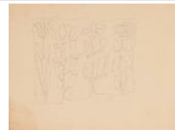
Untitled (Floral Design) (2013.17.13)