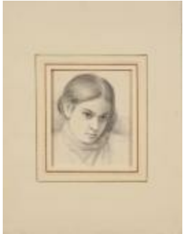
Untitled (Pencil Sketch Self Portrait) (2023.22.1)