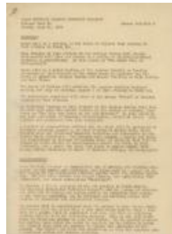
Black Mountain College Community Bulletin 5 (2002.7.4)