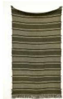
Dark Gray Throw (2006.20.2)