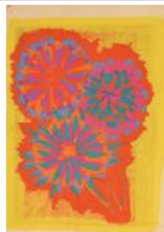
Untitled (Floral Abstract) (2013.17.7)