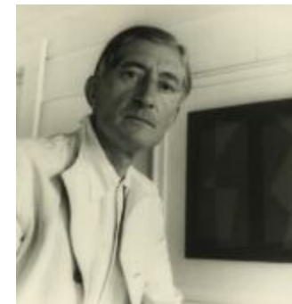
Josef Albers, Black Mountain College, North Carolina, Summer 1944 (PG2020.34.1)