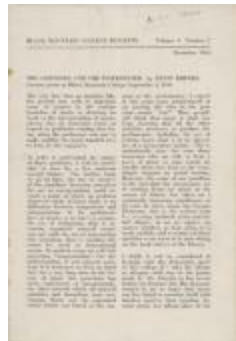
Black Mountain College Bulletin, Volume 3, Number 2: The Composer and the Interpreter (2002.7.1)