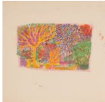
Untitled (Landscape) (2013.17.10)