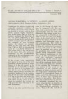
Black Mountain College Bulletin, Volume 3, Number 1: Arnold Schoenberg at Seventy (2002.7.3)