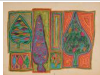
Untitled (Design) (2013.17.12)