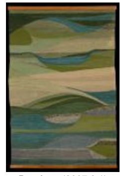
Bay Area (2007.8.1)