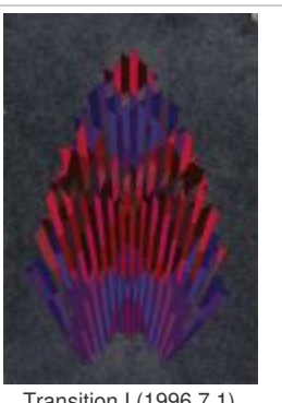
Transition I (1996.7.1)