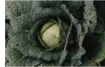
Untitled (Cabbage) (2013.2.9)