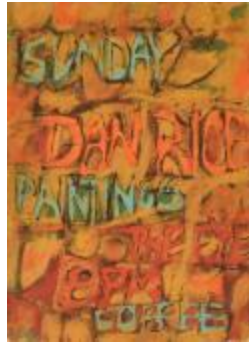
Sunday, Dan Rice Paintings, The Eye, 8 PM, Coffee (2004.2.1)