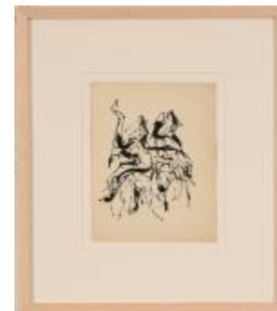
Untitled (JT717) (2015.24.1)