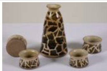
Giraffe Carafe with Four Cups (2015.8.1)