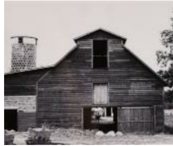
Barn and Silo with Cow in Doorway (2016.24.3)