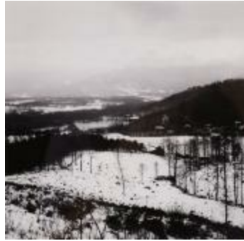
Landscape Near Lake Eden in the Snow (2016.24.1)