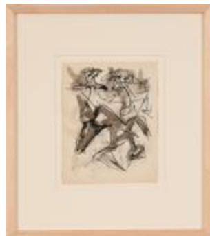
Untitled (JT719) (2015.24.3)