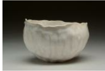
White Pinched Bowl (2017.5.1)