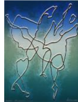
Nocturne (Memories of Merce) (1996.9.1)