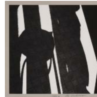
Untitled Part I (2002.8.11)