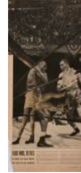
Magazine Collage (2013.16.17)