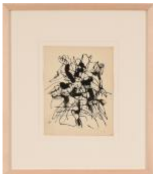
Untitled (JT718) (2015.24.2)