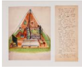
Untitled (Tent Diagram) (2012.6.1)