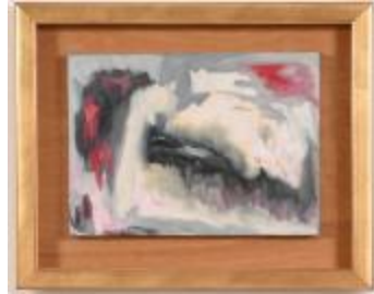
Arctic Dawn (2013.16.15)