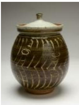
Lidded Jar (1999.2.2)