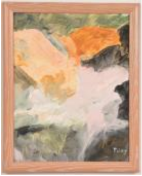
Dry Bear Creek (2013.16.12)