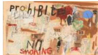
The Blues (2015.20.1)