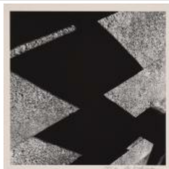
Untitled part II (2002.8.12)