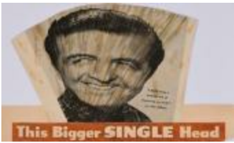
Magazine Collage (2013.16.19)