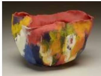
Red, Blue, Yellow, White Pinched Bowl (2017.5.5)