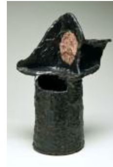
Folded Pot (2021.54.1)