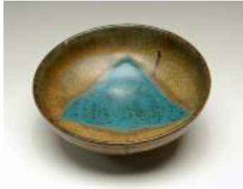
Flag Bowl (2008.6.1)