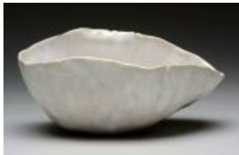
White Pinched Bowl (2015.10.1)