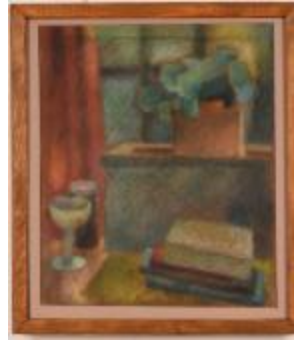
Early Still Life (2013.16.16)