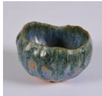
Green Bowl (1998.6.1)