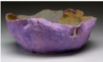
Lavender Pinched Bowl (2017.5.4)