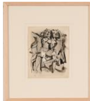
Untitled (JT720) (2015.24.4)