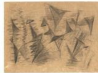
A Sketch (2010.2.1)