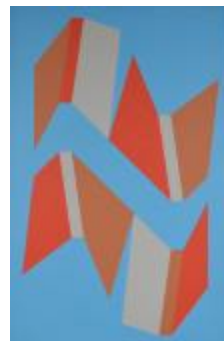
386 BM (2000.2.2)