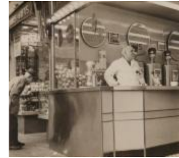
Times Square (2008.32.1)