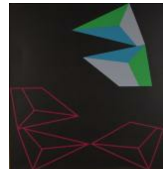
569 EV (2000.2.4)