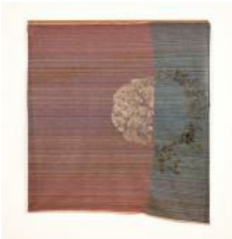
Wall Hanging (2021.56.1)