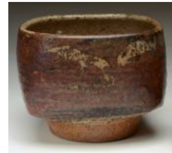
Small Bowl (1999.2.1)