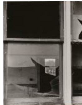
Magic Realism (2015.23.1)