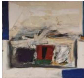
Gloucester Harbor (2015.16.1)