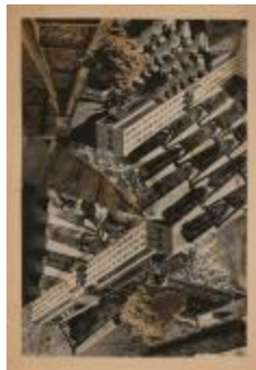
Magazine Collage (2013.16.20)