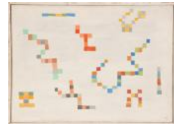
Composition with Dot (2010.2.2)