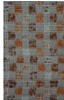
8 Harness Group Weaving Sample (1997.6.2)