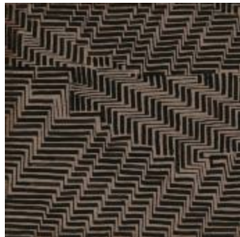
Design Study (1997.6.4)