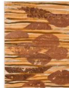
Leaf Study (1997.6.3)