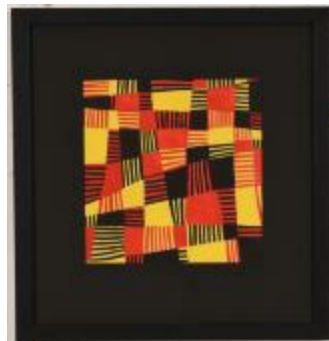
Color Study (1997.6.5)