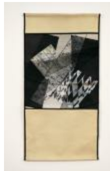
Path of Illumination #8 (2010.4.1)