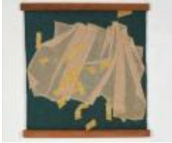
Untitled (Wall Hanging) (2013.16.13)