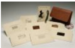
Fiber Samples for Anni Albers' Weaving Class (2017.10.1)