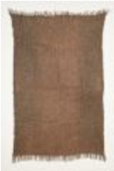
Mohair Throw (2013.2.13)