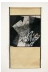
Path of Illumination #8 (2010.4.1)