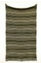
Dark Gray Throw (2006.20.2)