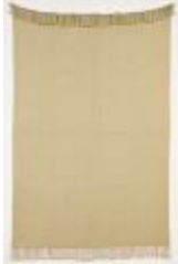
Cashmere Throw (2013.2.12)