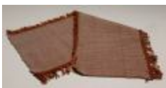
Upholstery Fabric (2021.55.1)