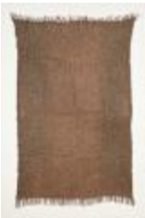
Mohair Throw (2013.2.13)