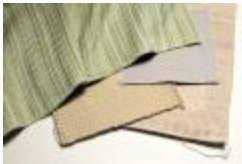
Nantucket Looms Fabric Samples (2013.2.14)