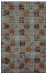
8 Harness Group Weaving Sample (1997.6.2)