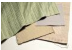
Nantucket Looms Fabric Samples (2013.2.14)