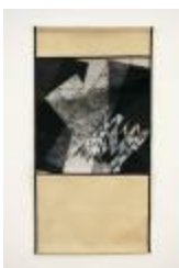
Path of Illumination #8 (2010.4.1)