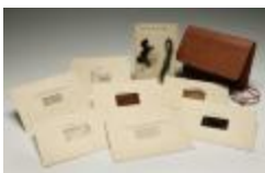
Fiber Samples for Anni Albers' Weaving Class (2017.10.1)