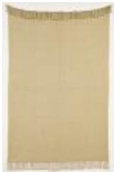
Cashmere Throw (2013.2.12)