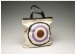
Coach Tote Bag with Target (2013.10.1)