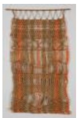
Wall Hanging (2021.56.1)