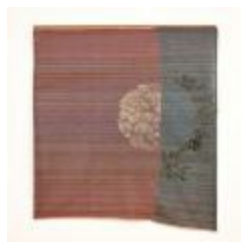
Wall Hanging (2021.56.1)