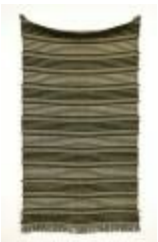
Dark Gray Throw (2006.20.2)