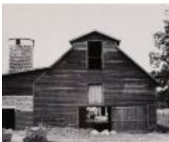
Barn and Silo with Cow in Doorway (2016.24.3)