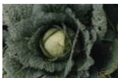
Untitled (Cabbage) (2013.2.9)