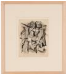
Untitled (JT720) (2015.24.4)