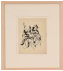
Untitled (JT717) (2015.24.1)