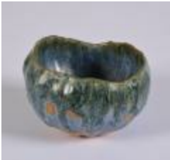
Green Bowl (1998.6.1)