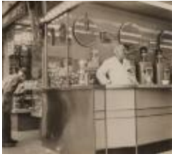
Times Square (2008.32.1)