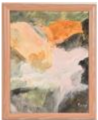
Dry Bear Creek (2013.16.12)