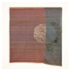
Wall Hanging (2021.56.1)