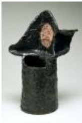
Folded Pot (2021.54.1)