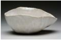
White Pinched Bowl (2015.10.1)