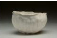
White Pinched Bowl (2017.5.1)