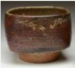
Small Bowl (1999.2.1)