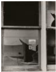
Magic Realism (2015.23.1)