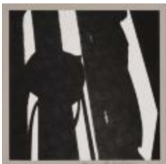
Untitled Part I (2002.8.11)