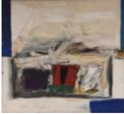
Gloucester Harbor (2015.16.1)