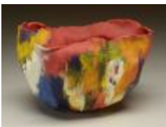
Red, Blue, Yellow, White Pinched Bowl (2017.5.5)