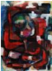
Market Vendor (2021.53.1)