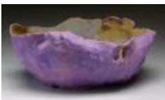
Lavender Pinched Bowl (2017.5.4)