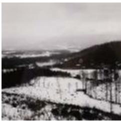
Landscape Near Lake Eden in the Snow (2016.24.1)