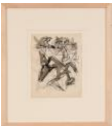
Untitled (JT719) (2015.24.3)