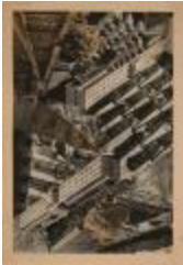
Magazine Collage (2013.16.20)