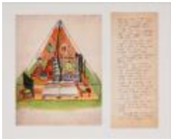
Untitled (Tent Diagram) (2012.6.1)