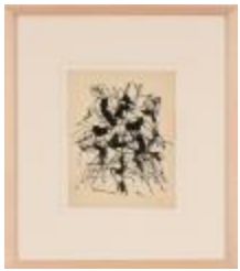
Untitled (JT718) (2015.24.2)