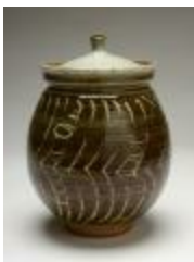
Lidded Jar (1999.2.2)