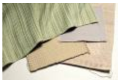
Nantucket Looms Fabric Samples (2013.2.14)