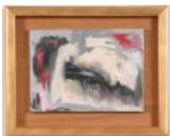
Arctic Dawn (2013.16.15)