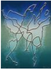
Nocturne (Memories of Merce) (1996.9.1)