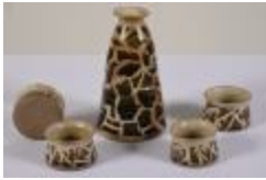
Giraffe Carafe with Four Cups (2015.8.1)