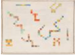
Composition with Dot (2010.2.2)