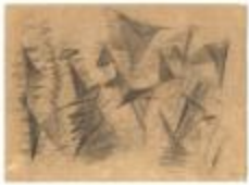
A Sketch (2010.2.1)