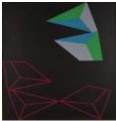
569 EV (2000.2.4)