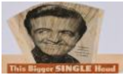
Magazine Collage (2013.16.19)