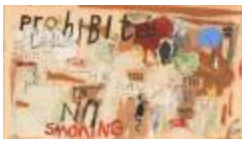
The Blues (2015.20.1)