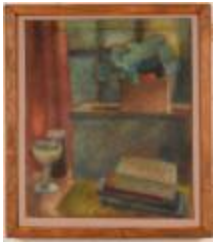
Early Still Life (2013.16.16)