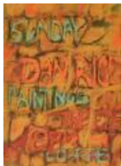
Sunday, Dan Rice Paintings, The Eye, 8 PM, Coffee (2004.2.1)