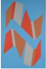
386 BM (2000.2.2)