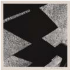
Untitled part II (2002.8.12)