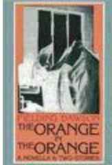
The orange in the orange : a novella & two stories (120032572)