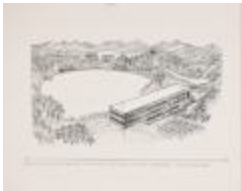
Recollection of Black Mountain College 1942-43 (1995.11.1)