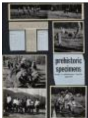
Prehistoric Specimens vs. Modern Neurotics: Sports at Black Mountain College (1995.16.1)