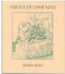
Visions of dame kind (Jargon 113) (84318497)