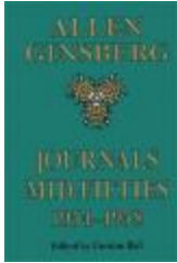
Journals mid-fifties, 1954-1958 (117607509)