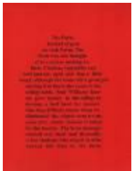
The Farm (1995.31.1)