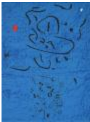
Red Moon, White Sun (2008.24.1)