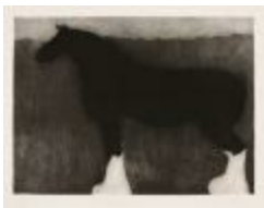
Standing Horse (2001.2.1)