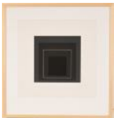
Gray Instrumentation I (2008.29.1)