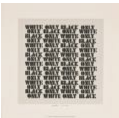
A Mnemonic Wallpaper Pattern for Southern Two-Seaters (2007.4.7)