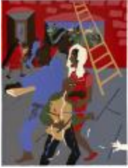
Right of Way (2021.59.2)