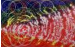
Shadowed Perimeter (2009.3.1)