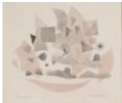
Voyage #1 (2017.1.5)