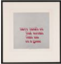
Snuffy Smith's Colossal Maw From War-Woman Dell, Georgia: More Mouth on That Woman Than Ass on a Goose (2007.4.3)