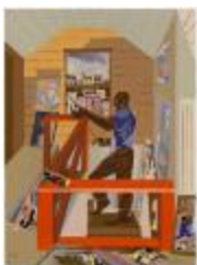
In the Studio (2021.38.1)