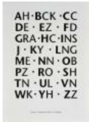
Olsen's Fisherman's Nautical Alphabet (2016.7.2)