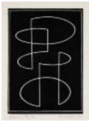
Block Print #2 (2011.18.1)