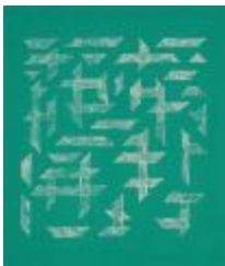
Double Impression III (2013.6.1)