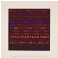
A Chorale* of Cherokee Night Music As Heard Through an Open Window in Summer Long Ago (2007.4.5)