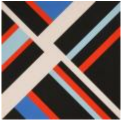
Black Diamond (2007.5.1)