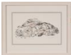
Prismatic Mountain (2017.1.6)