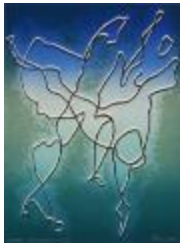
Nocturne (Memories of Merce) (1996.9.1)