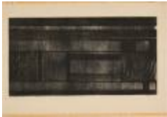
An Egyptian View (2010.2.3)