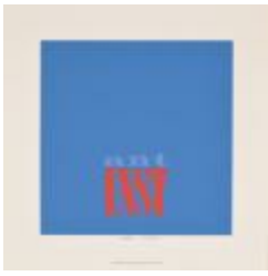
Meanwhile, Down at the Formicary, Time Flies (2007.4.2)