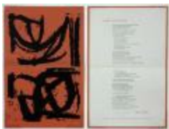
Song of the Border-Guard (2001.1.1)