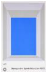
Cinetic Window (1972 Olympic Games, Munich) (2008.23.1)