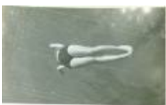
Student diving into Lake Eden (2003.7.31)