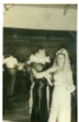
Costume party in the dining hall of the Lake Eden campus (2003.7.32)