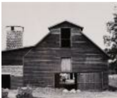
Barn and Silo with Cow in Doorway (2016.24.3)