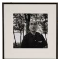
Stefan Wolpe, Black Mountain College (1998.5.12)