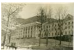
Robert E. Lee Hall (2003.7.1)