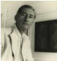
Josef Albers, Black Mountain College, North Carolina, Summer 1944 (PG2020.34.1)