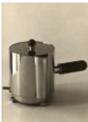
Electric Tea Kettle, stainless steel (2019.3.12)