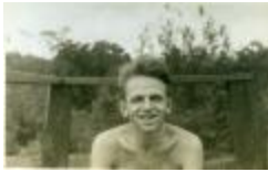
Student at Lake Eden (2003.7.45)