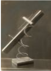
Floating Plastic: Illusionistic (Schwebende Plastik: Illusionistisch) (2019.3.1)