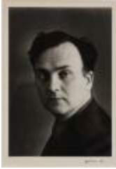
Portrait of Robert Duncan (2013.13.3)