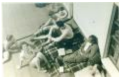
Students on the deck behind Lee Hall (2003.7.47)