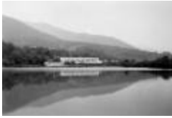
The Studies Building (2010.9.1)