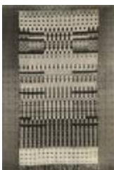
Bauhaus Textile (2019.3.13)