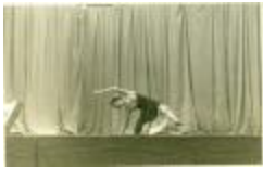
Outdoor stage performance (2003.7.61)