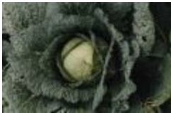
Untitled (Cabbage) (2013.2.9)