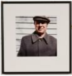
Harry Callahan, Providence, RI (1998.5.13)