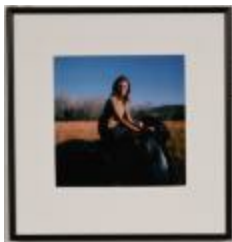
Francine du Plessix Gray, Cornwall Bridge, CT (1998.5.18)