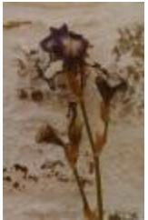
Untitled (Iris) (2013.2.7)