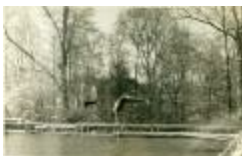
Student diving into Lake Eden (2003.7.30)