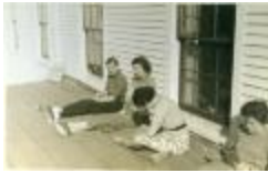
Students on the deck behind Lee Hall (2003.7.46)