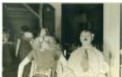
Costume party at the Lake Eden campus (2003.7.36)