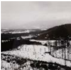
Landscape Near Lake Eden in the Snow (2016.24.1)